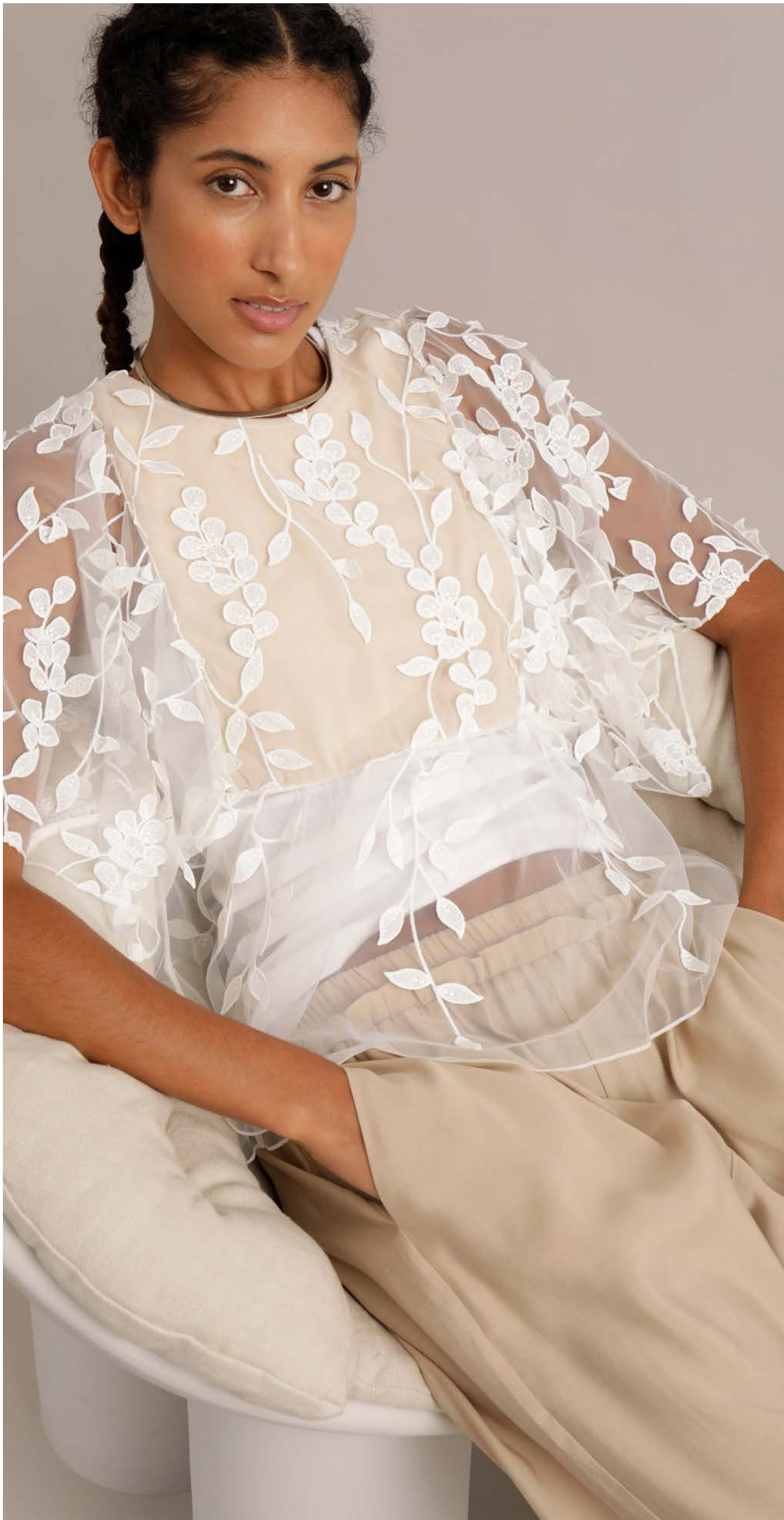
TOP / UMILINA - TOP / PEACH - PANTS / UELA