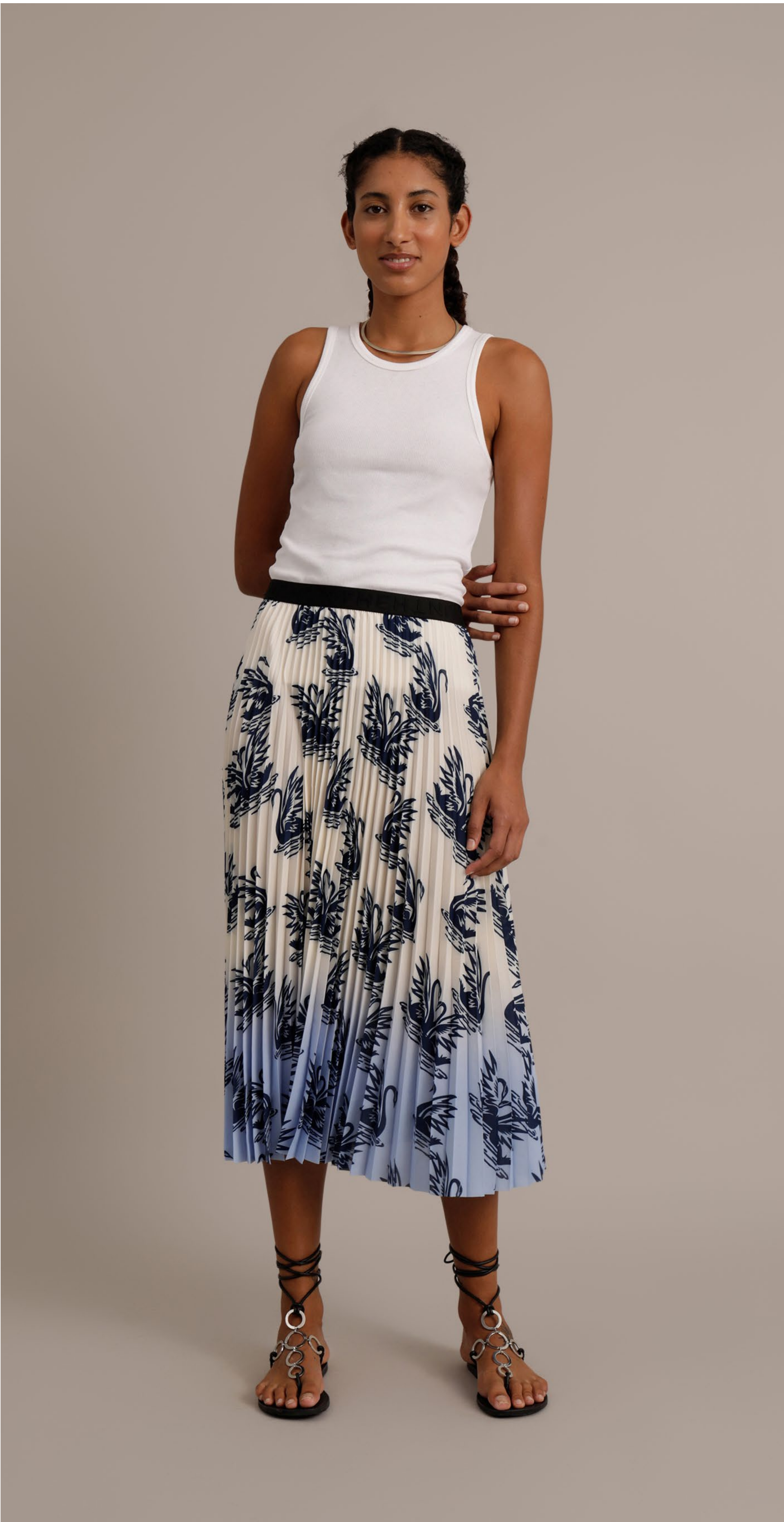
TOP / PEACH - SKIRT / UCCI