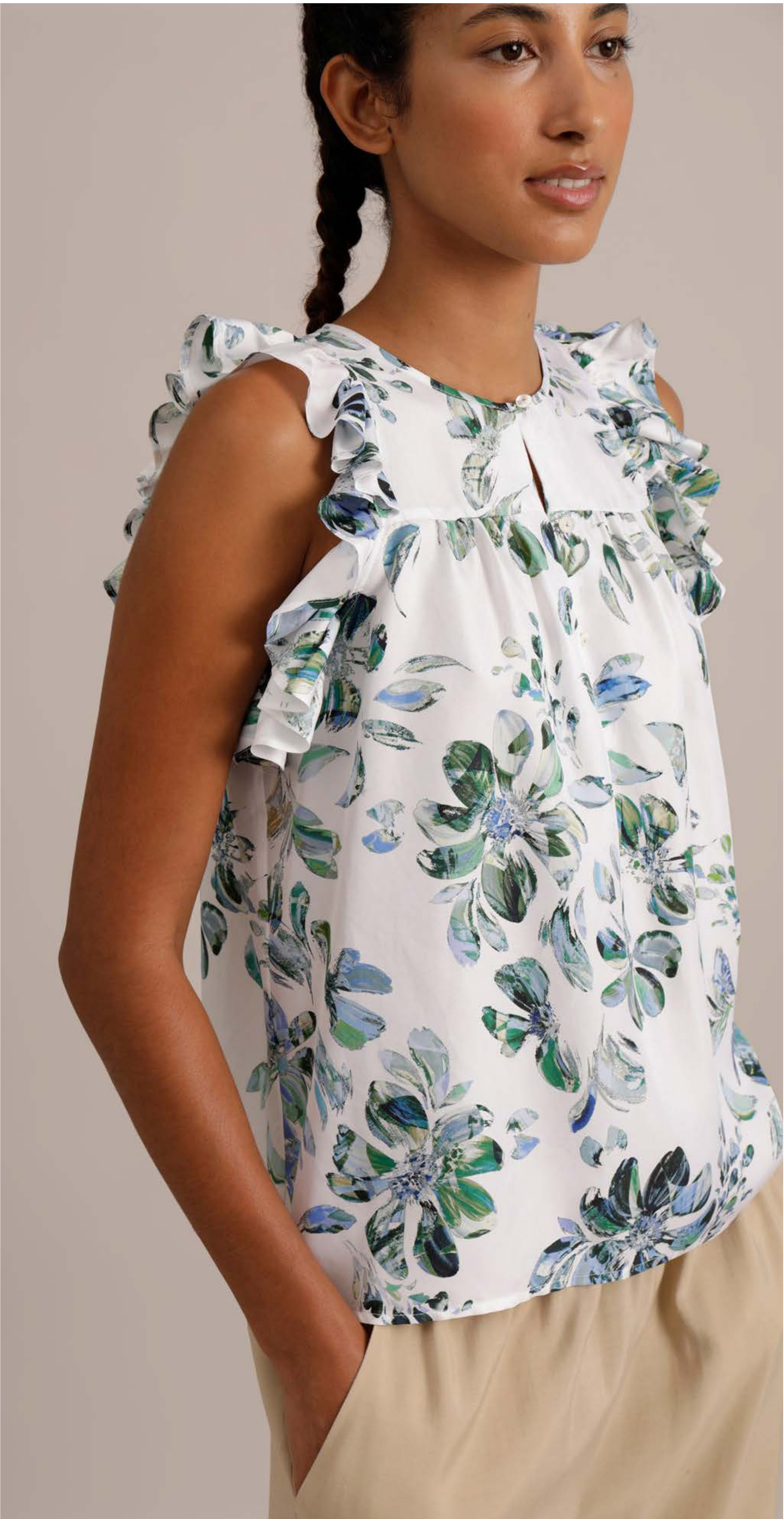
TOP / ULLA - PANTS / UELA