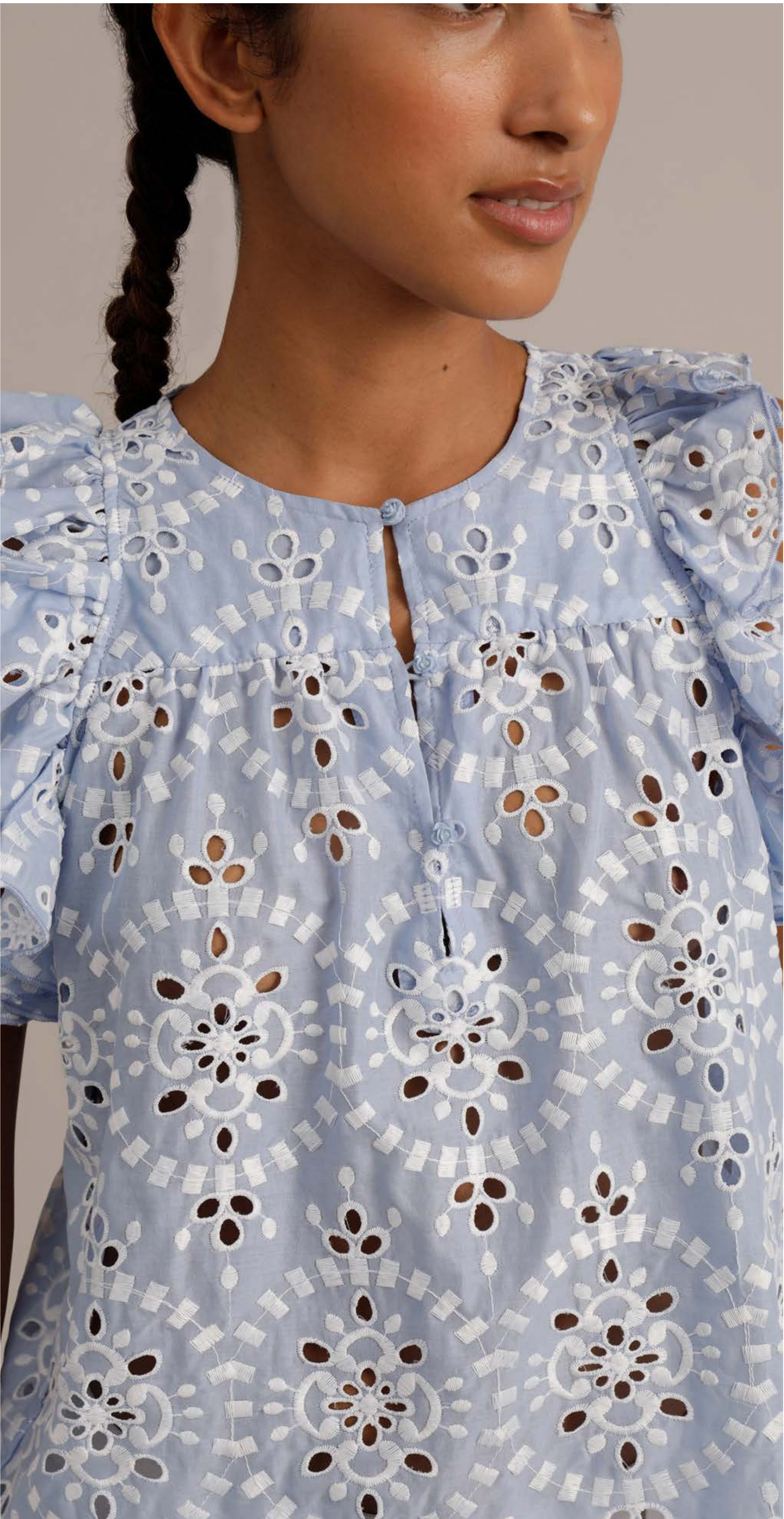
SHIRT / UFIBRA