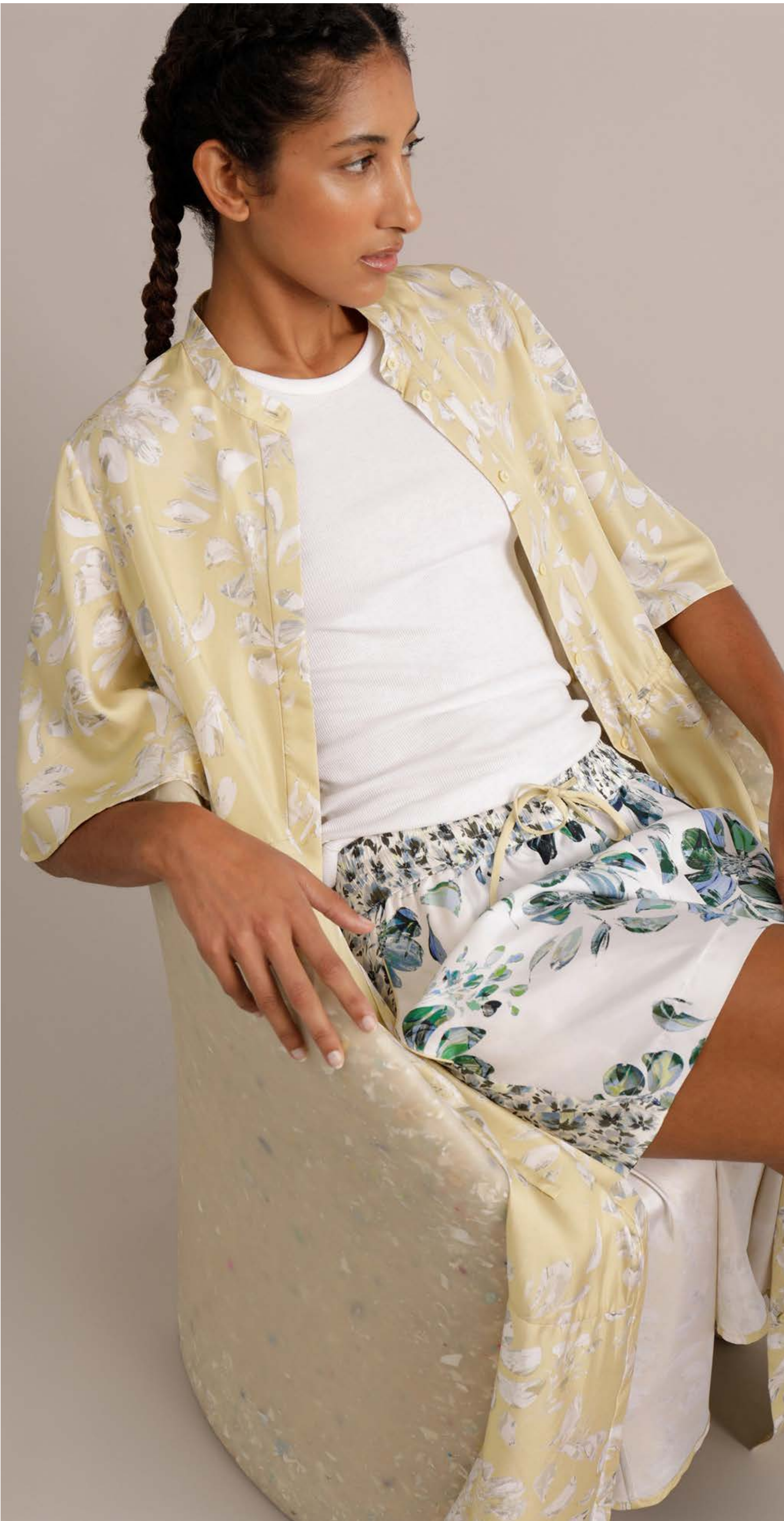
DRESS / UANTA - TOP / PEACH - SHORTS / UNIGA