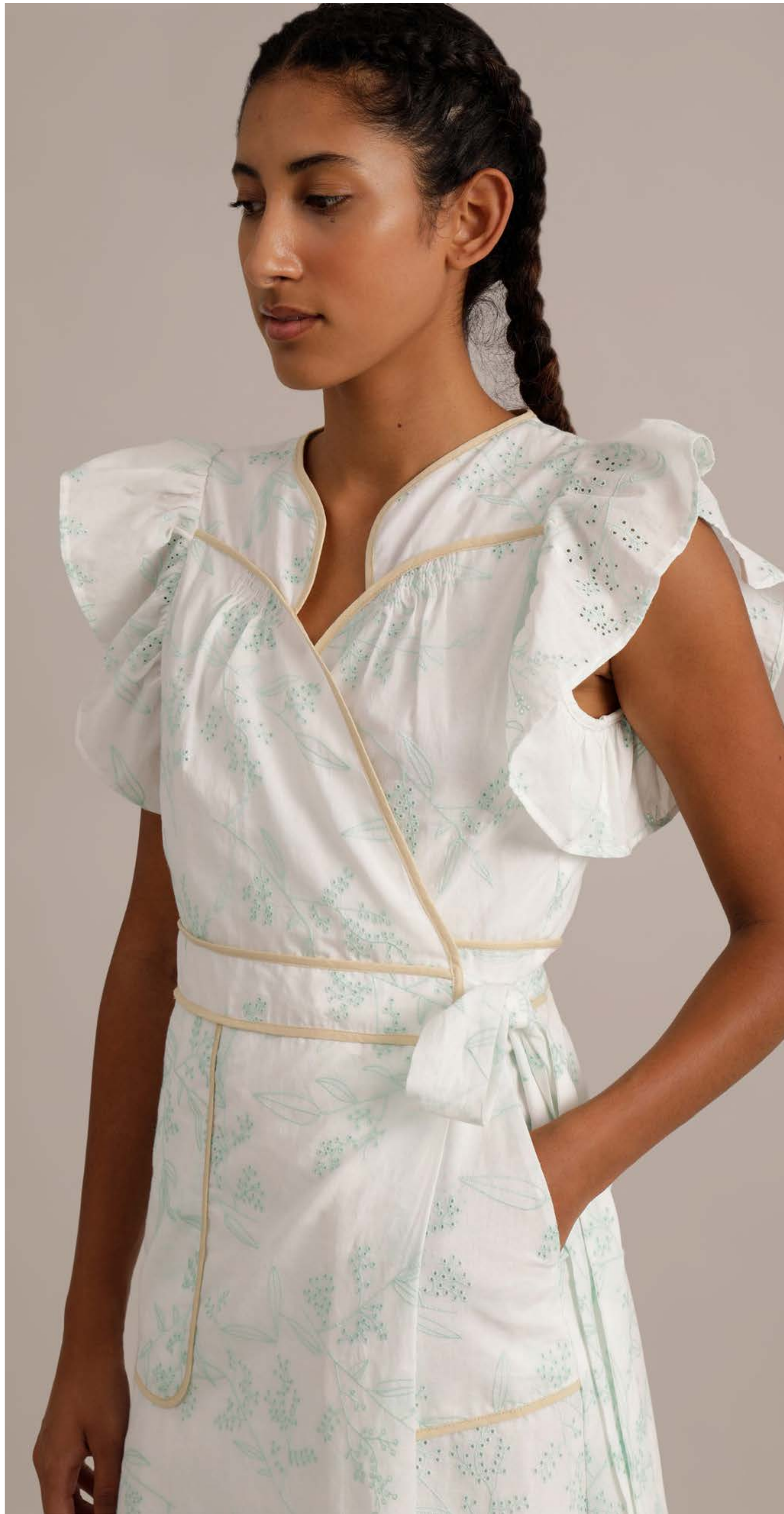
DRESS / UNKNOWN