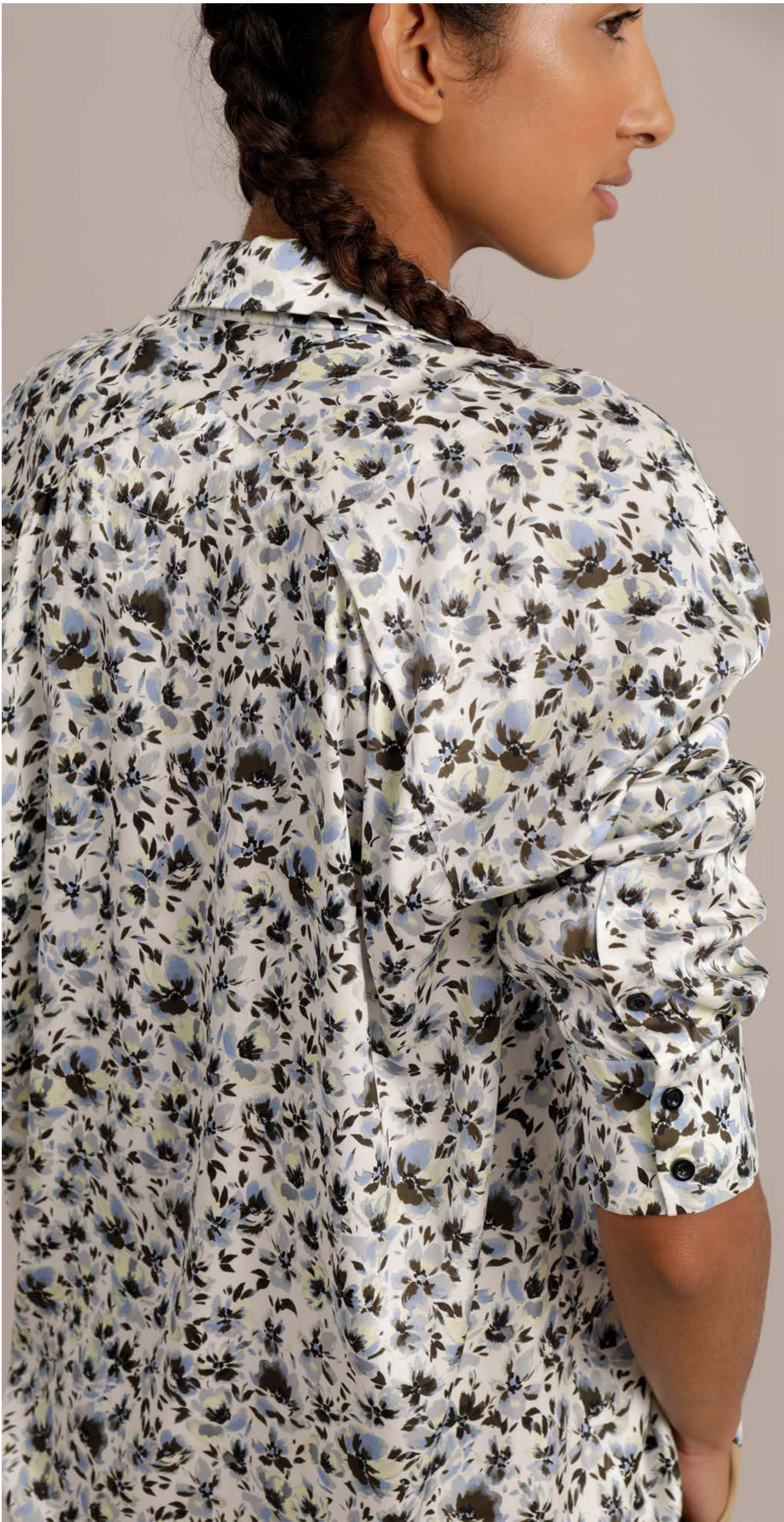
SHIRT / UTILIA