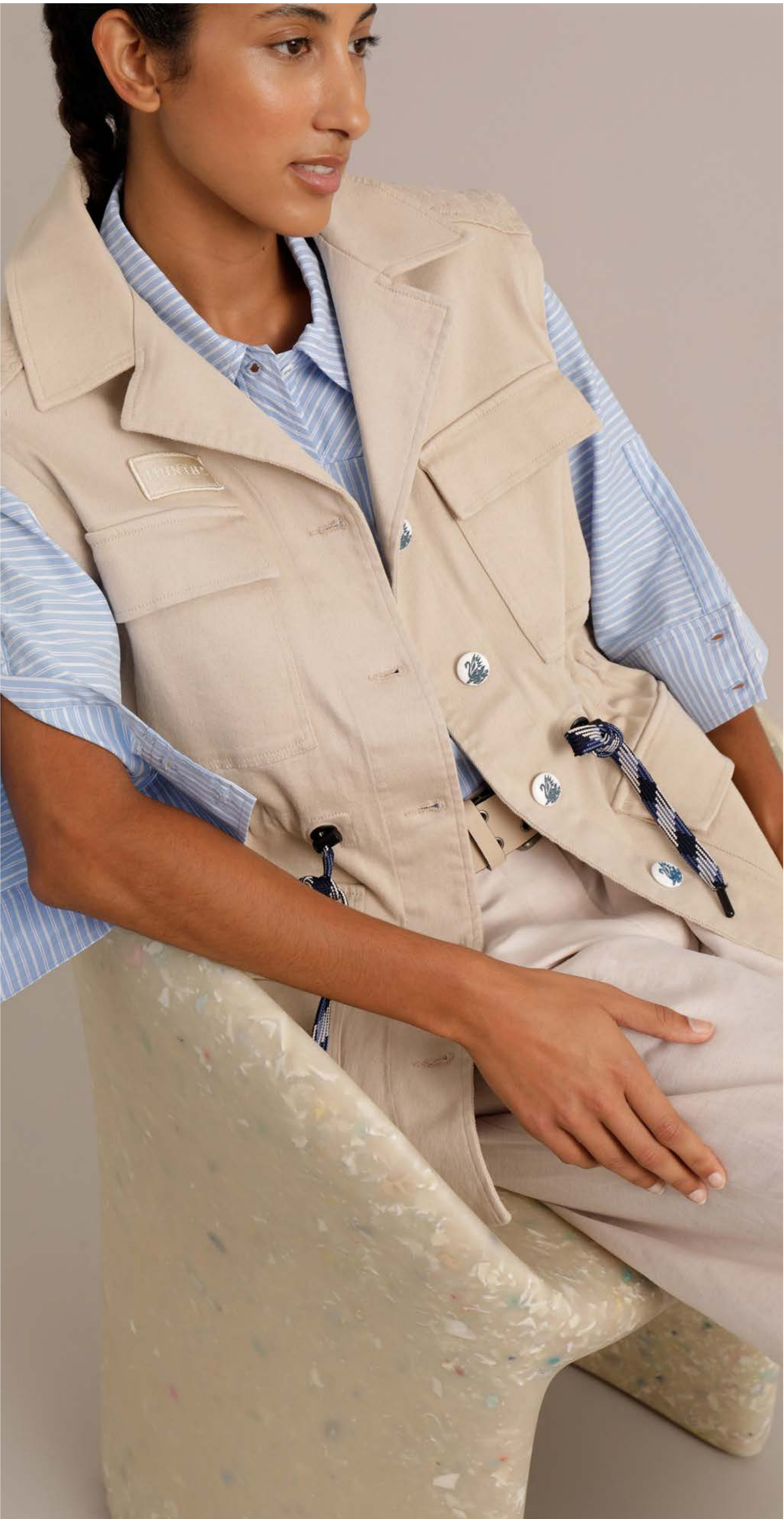
SHIRT / URANI - VEST / UBART - BELT / CADEN - PANTS / UCANA