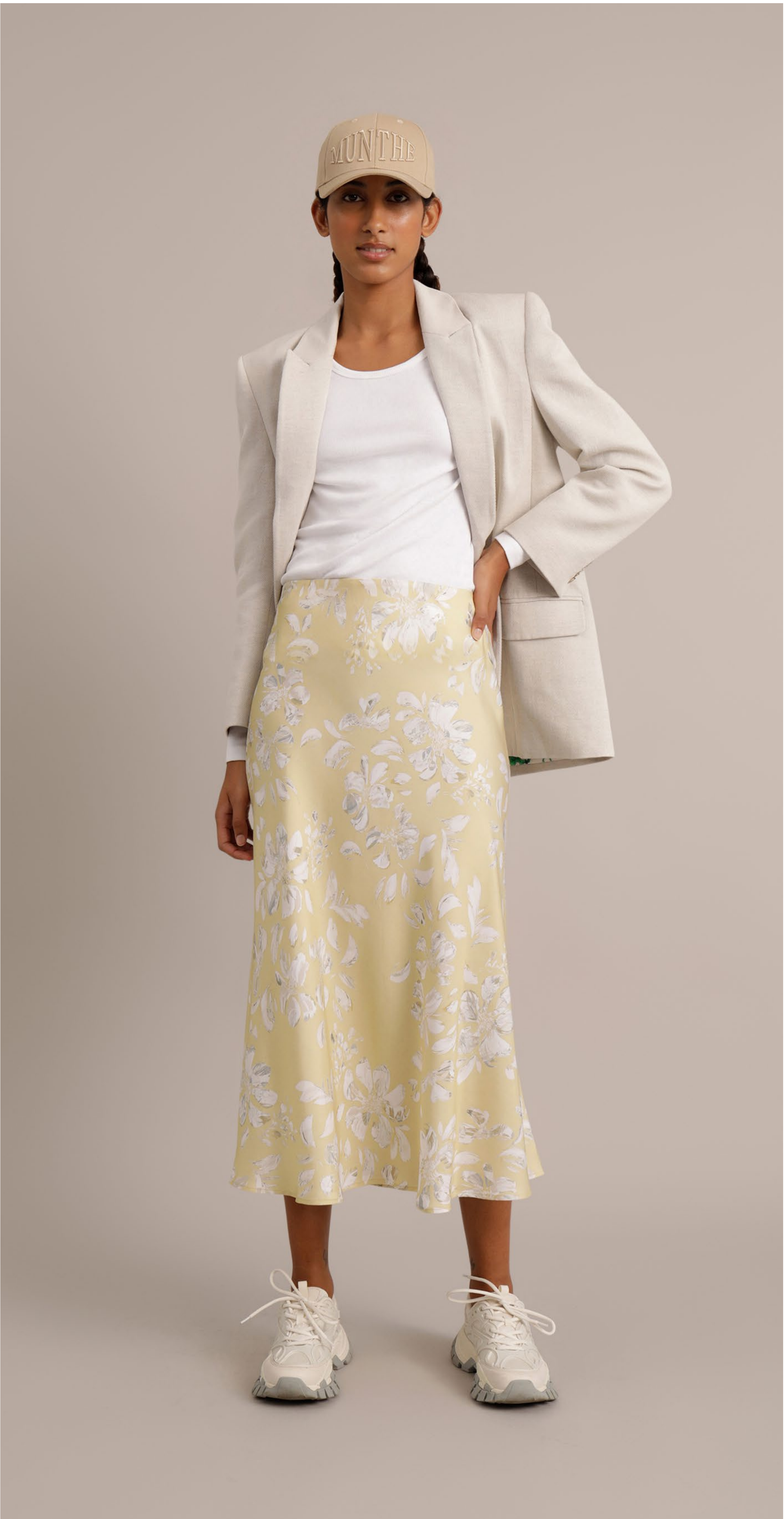
CAP / JEWEL - BLAZER / UBRE - T-SHIRT / CUTEST - SKIRT / UNDER