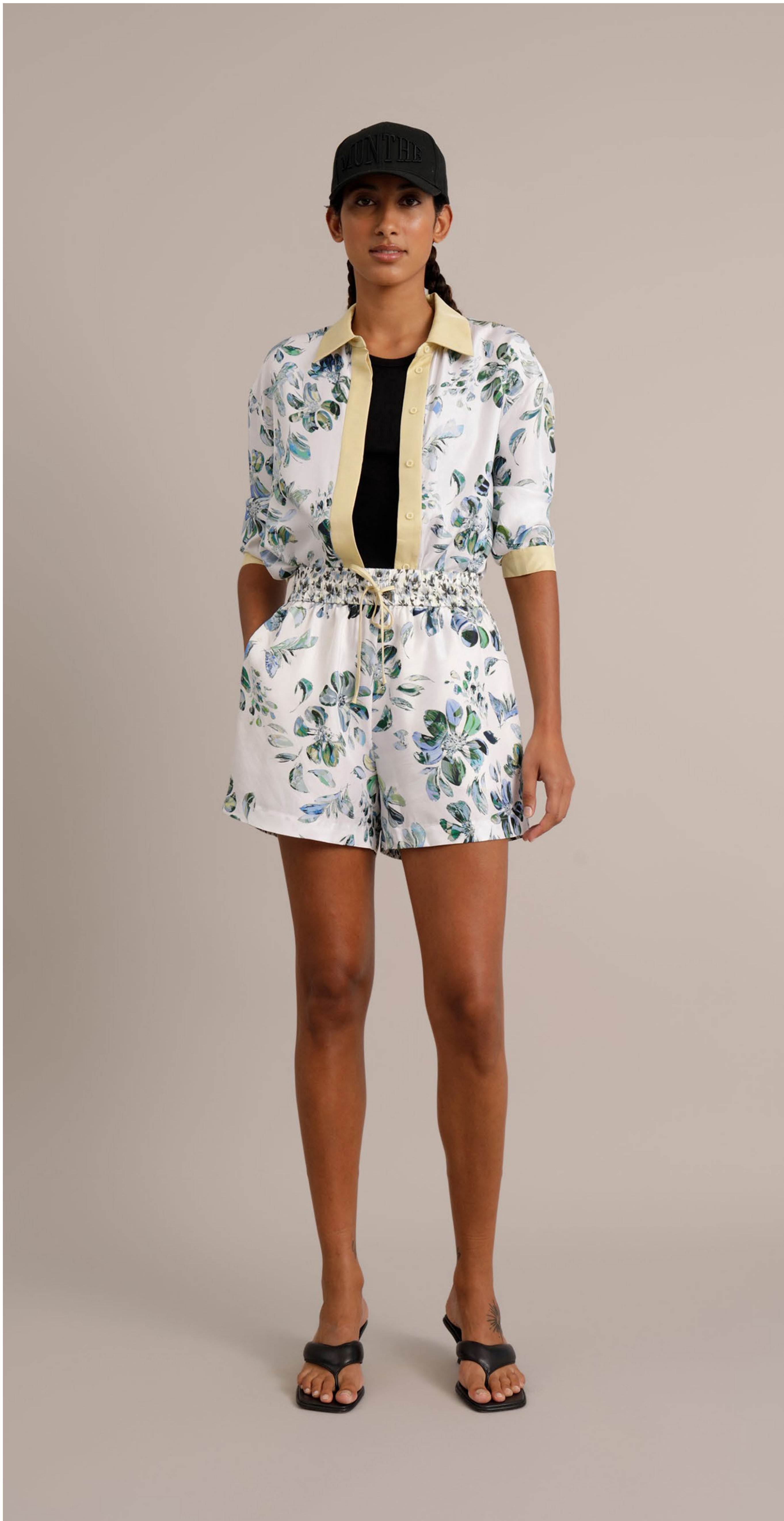
CAP / JEWEL - SHIRT / UTUI - TOP / PEACH - SHORTS / UNIGA