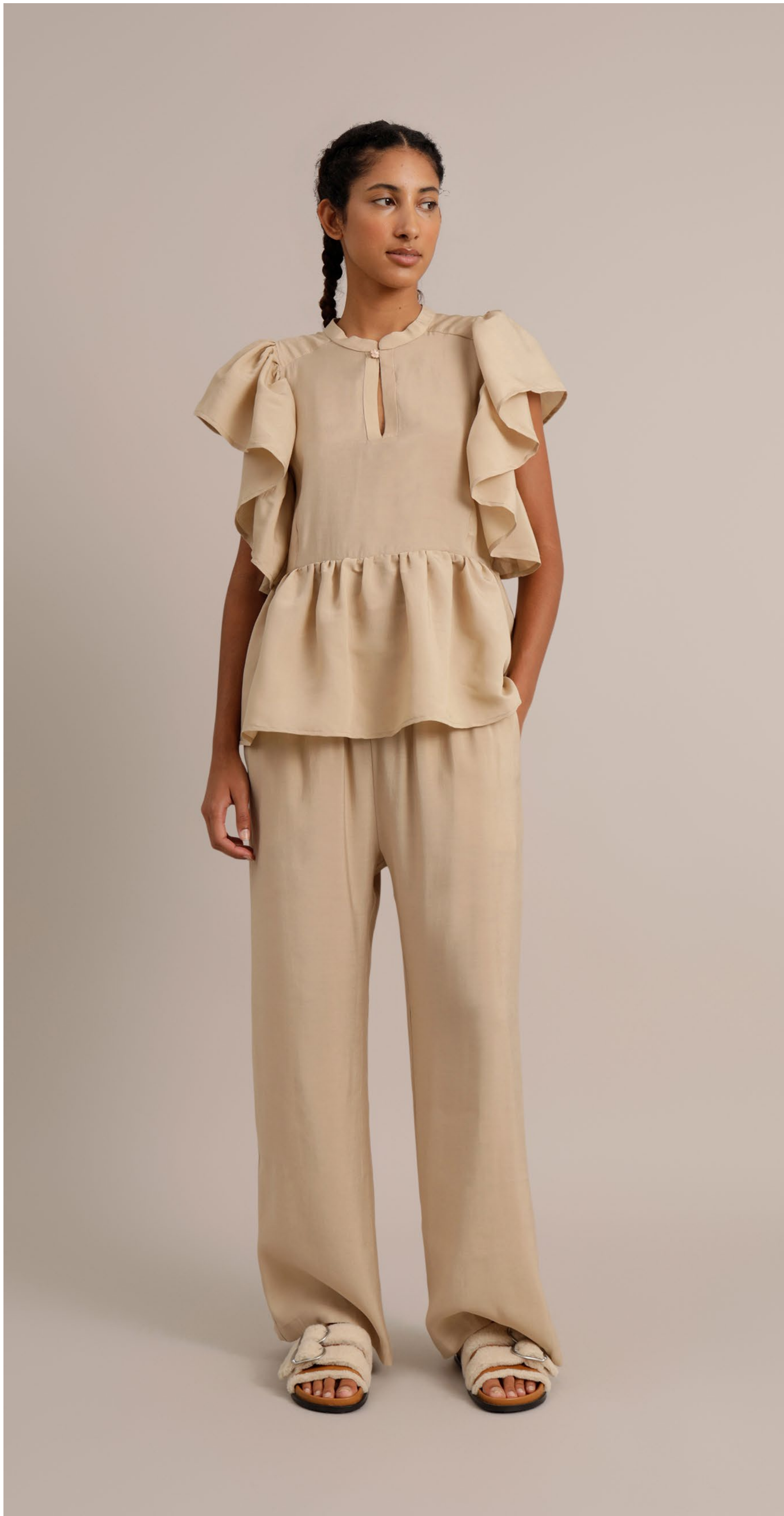
TOP / UFOLIA - PANTS / UELA - SHOES / JEMMY