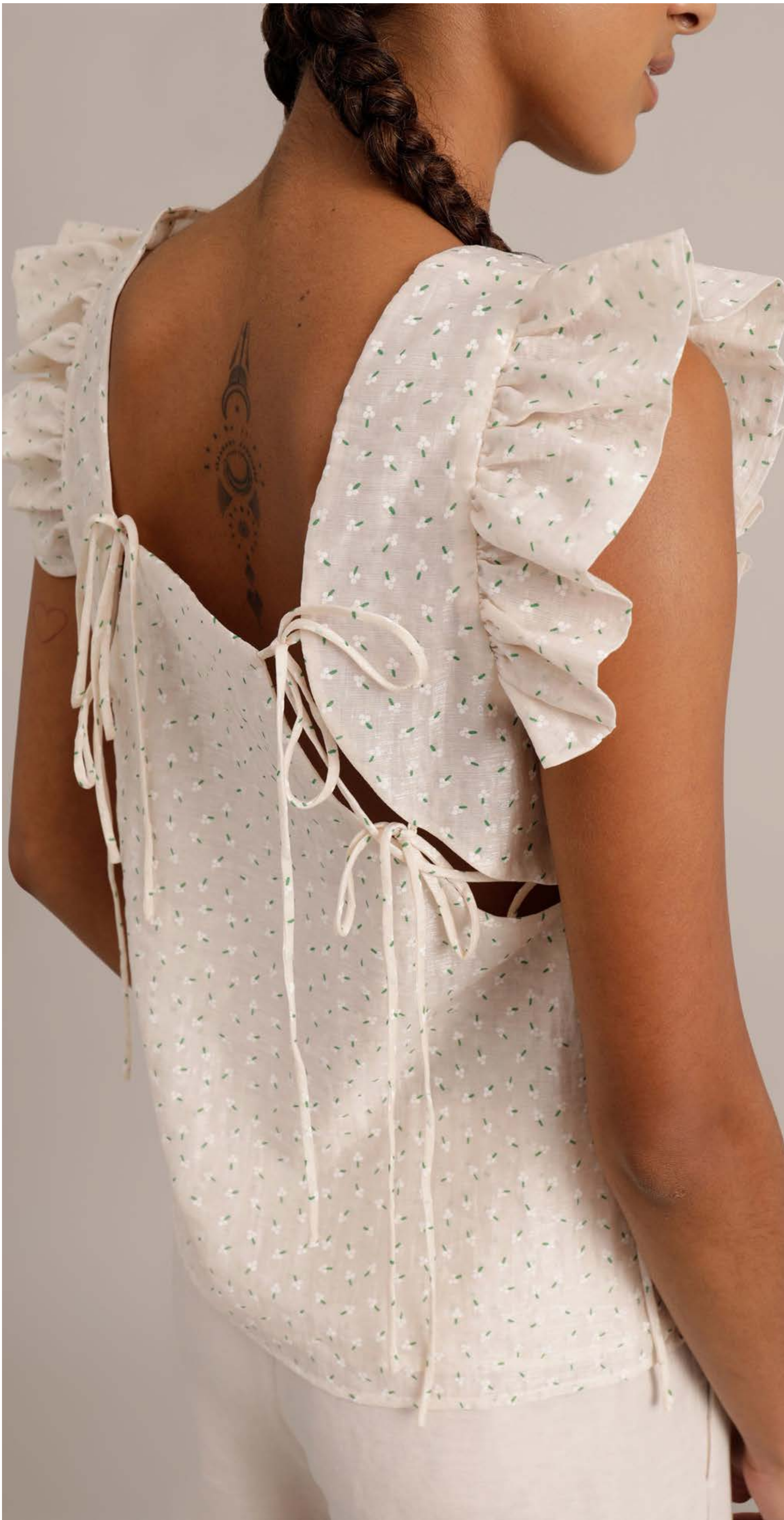
SHIRT / UHILU · PANTS / UCANA