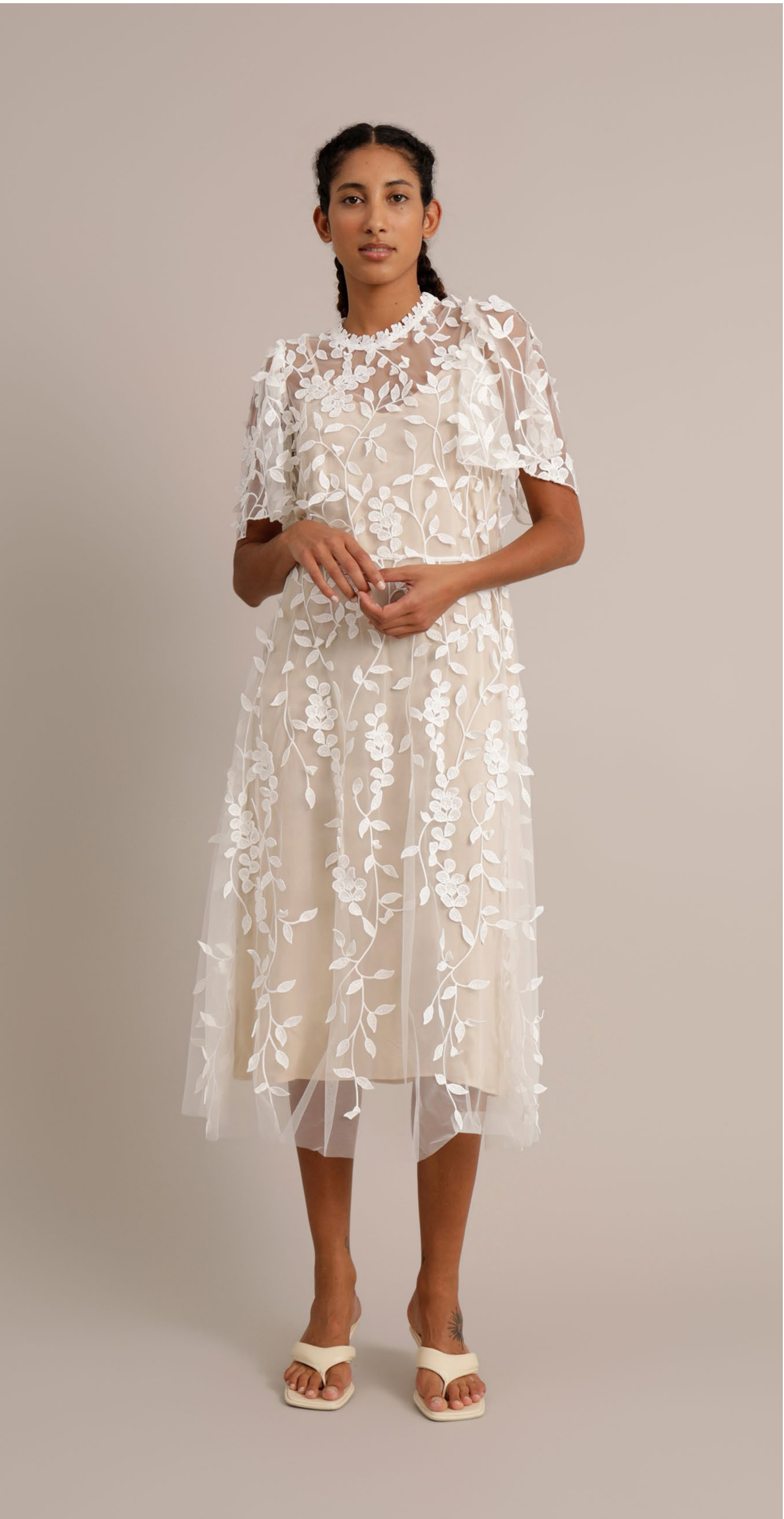
DRESS / URILANCA