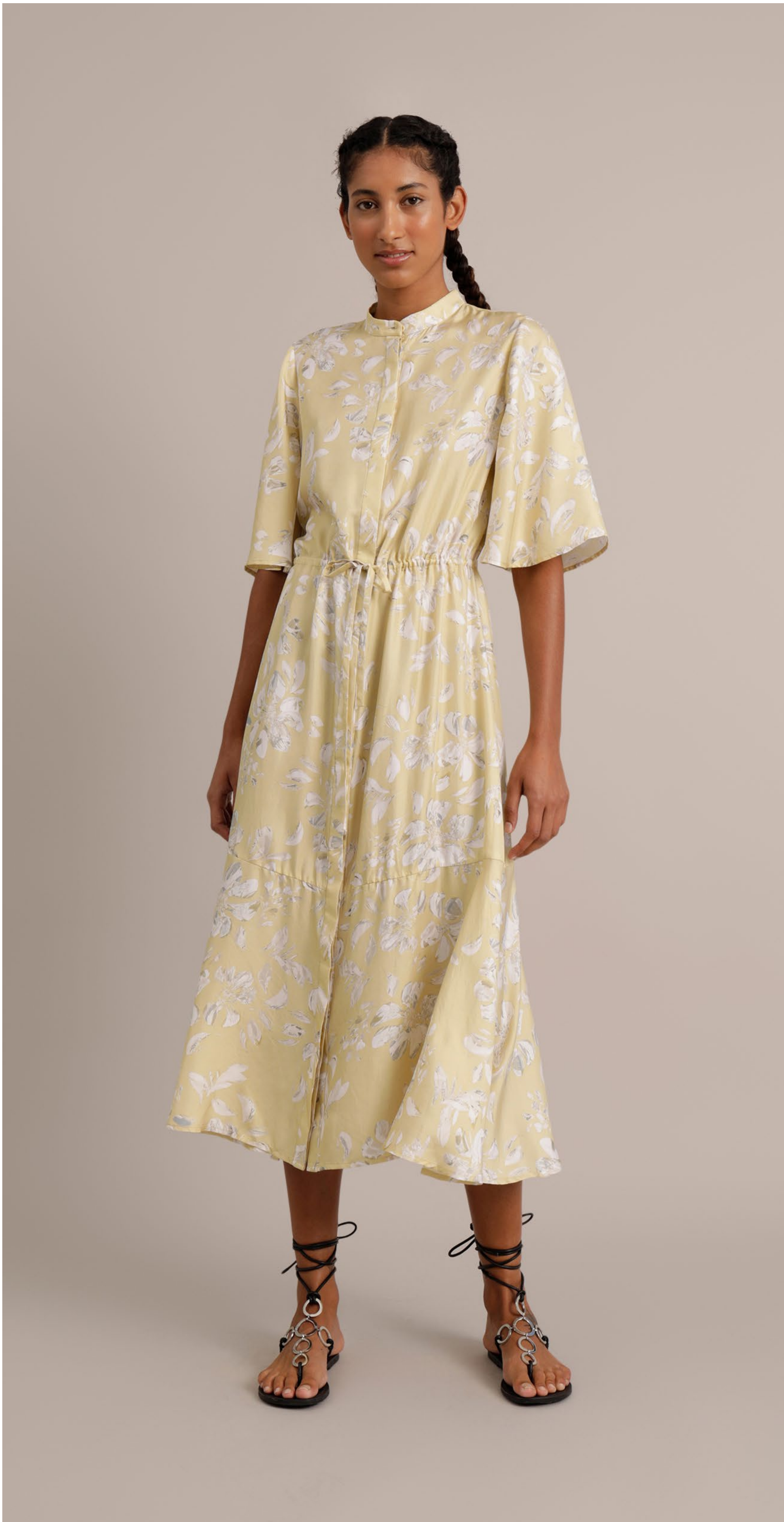
DRESS / UANTA