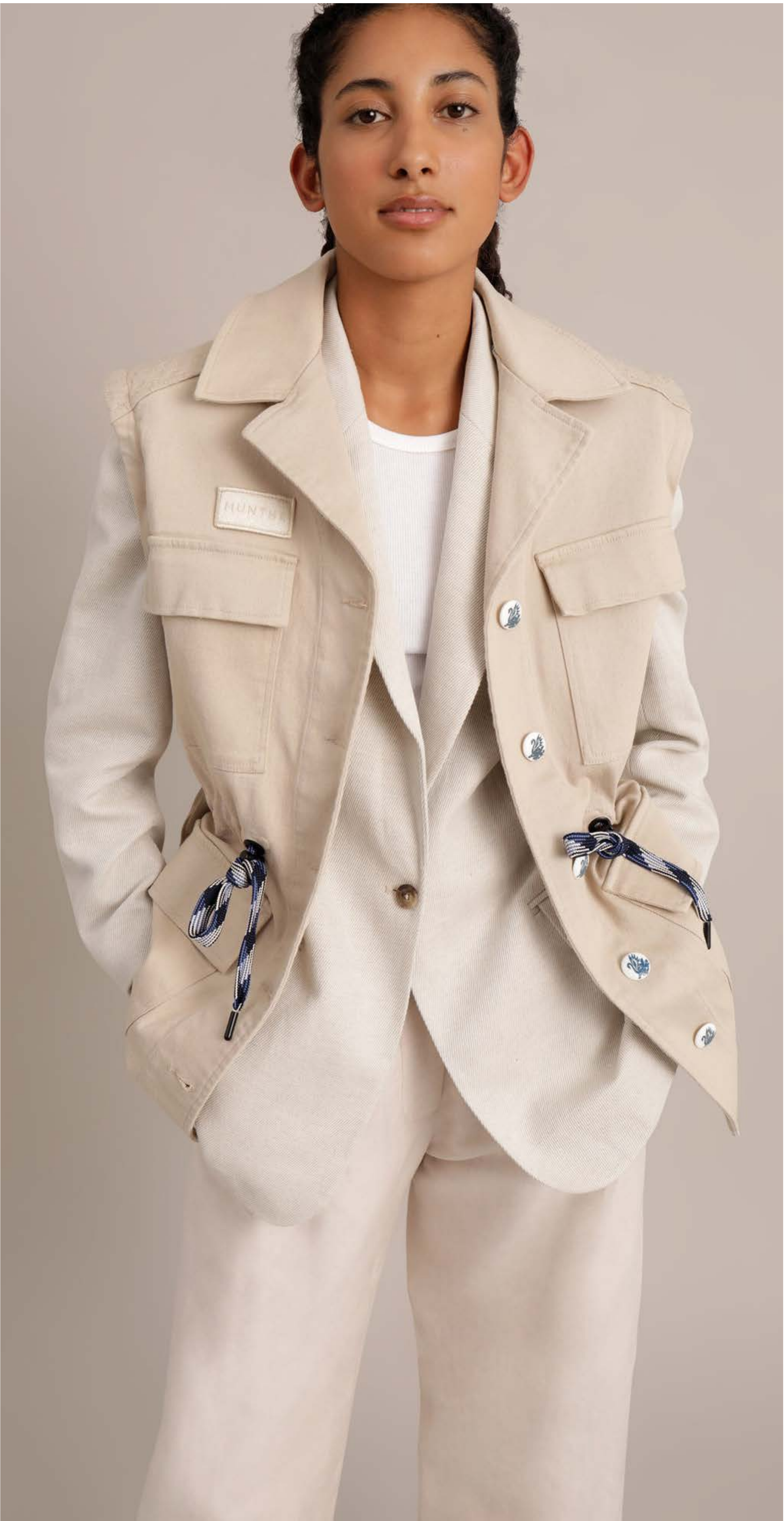
VEST / UBART - BLAZER / UBRE - TOP / CUTEST - PANTS / UCANA