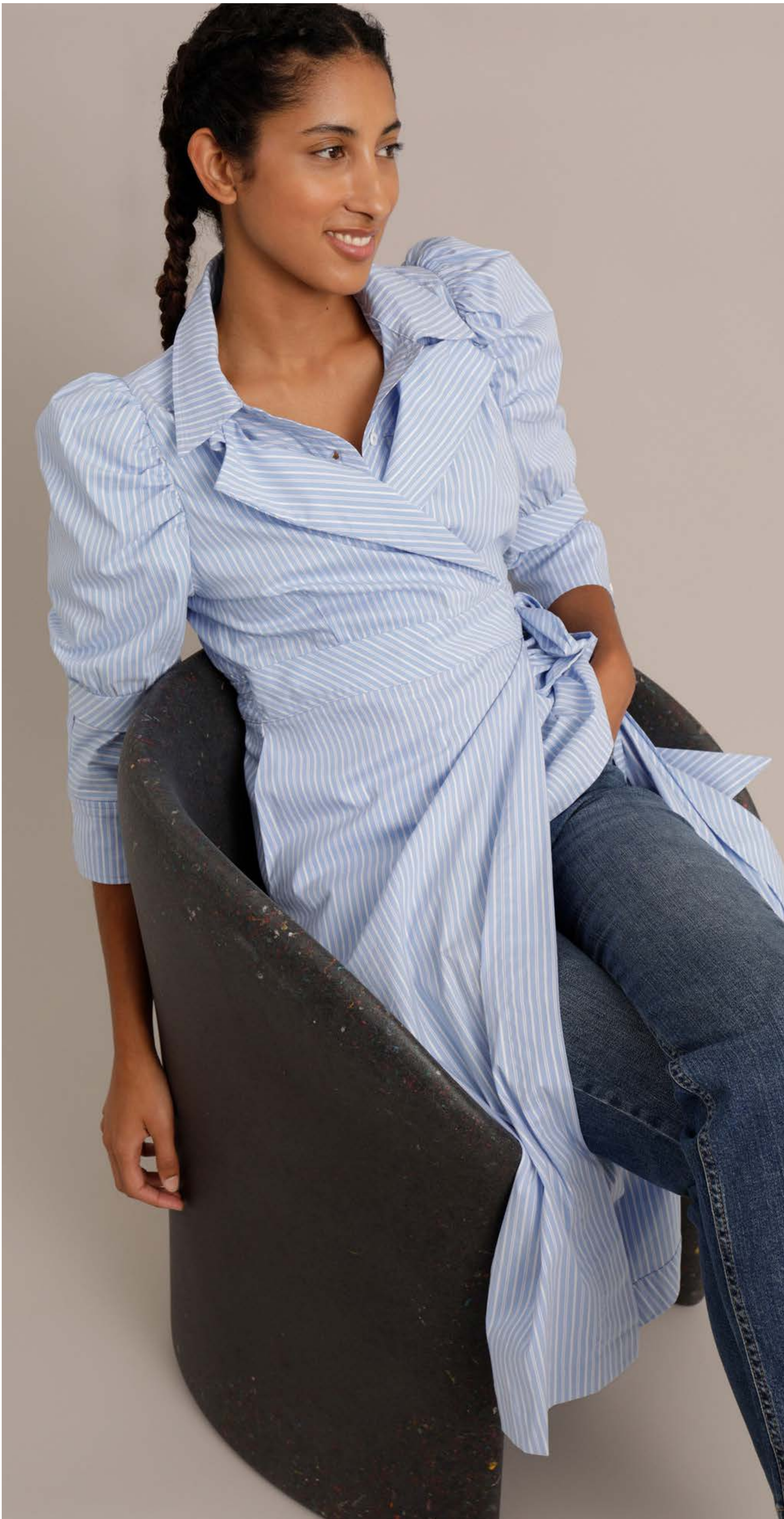
DRESS / UNDERWING - SHIRT / URANI - JEANS / KIMMY