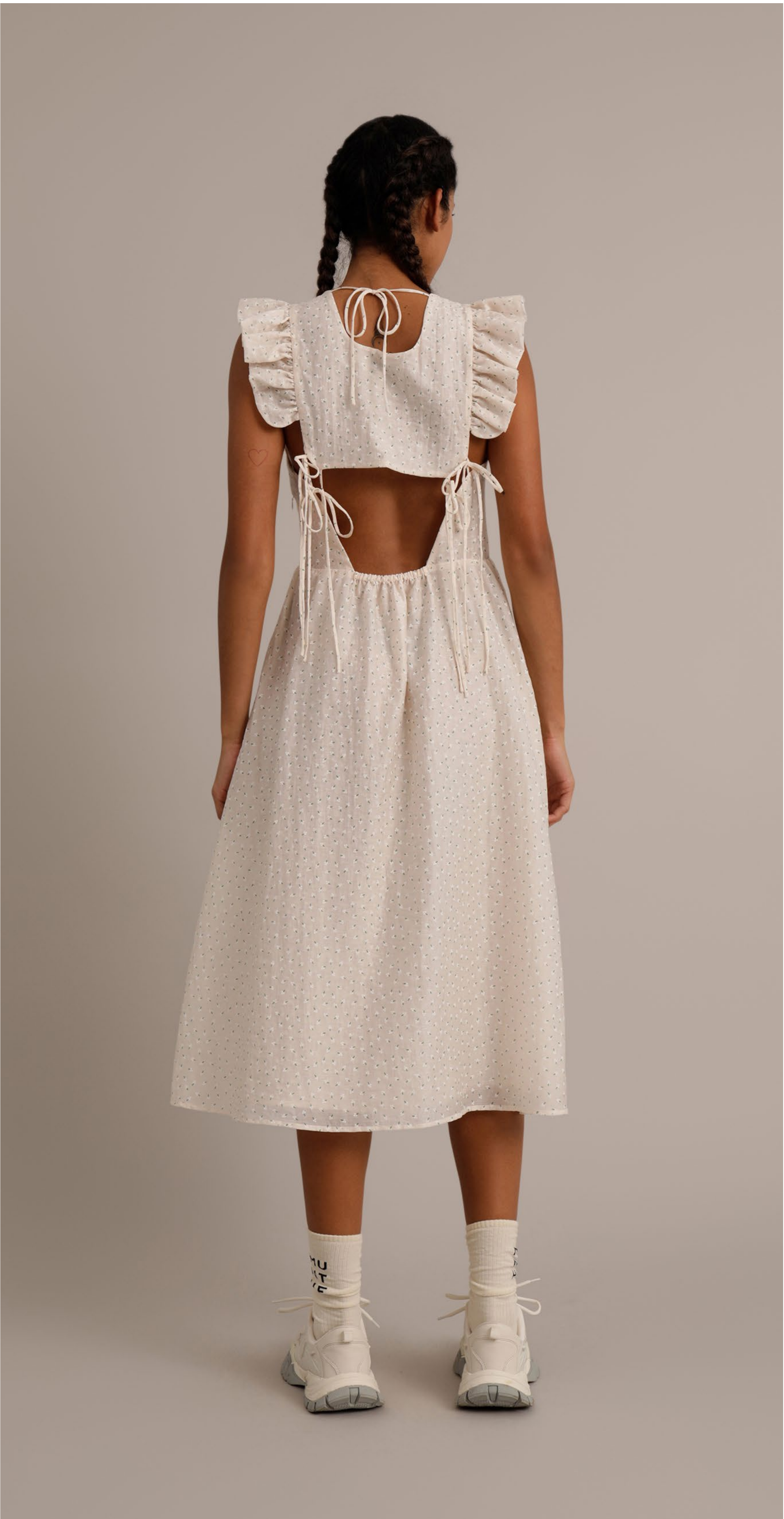
DRESS / UZORO - SOCKS / JAKAN