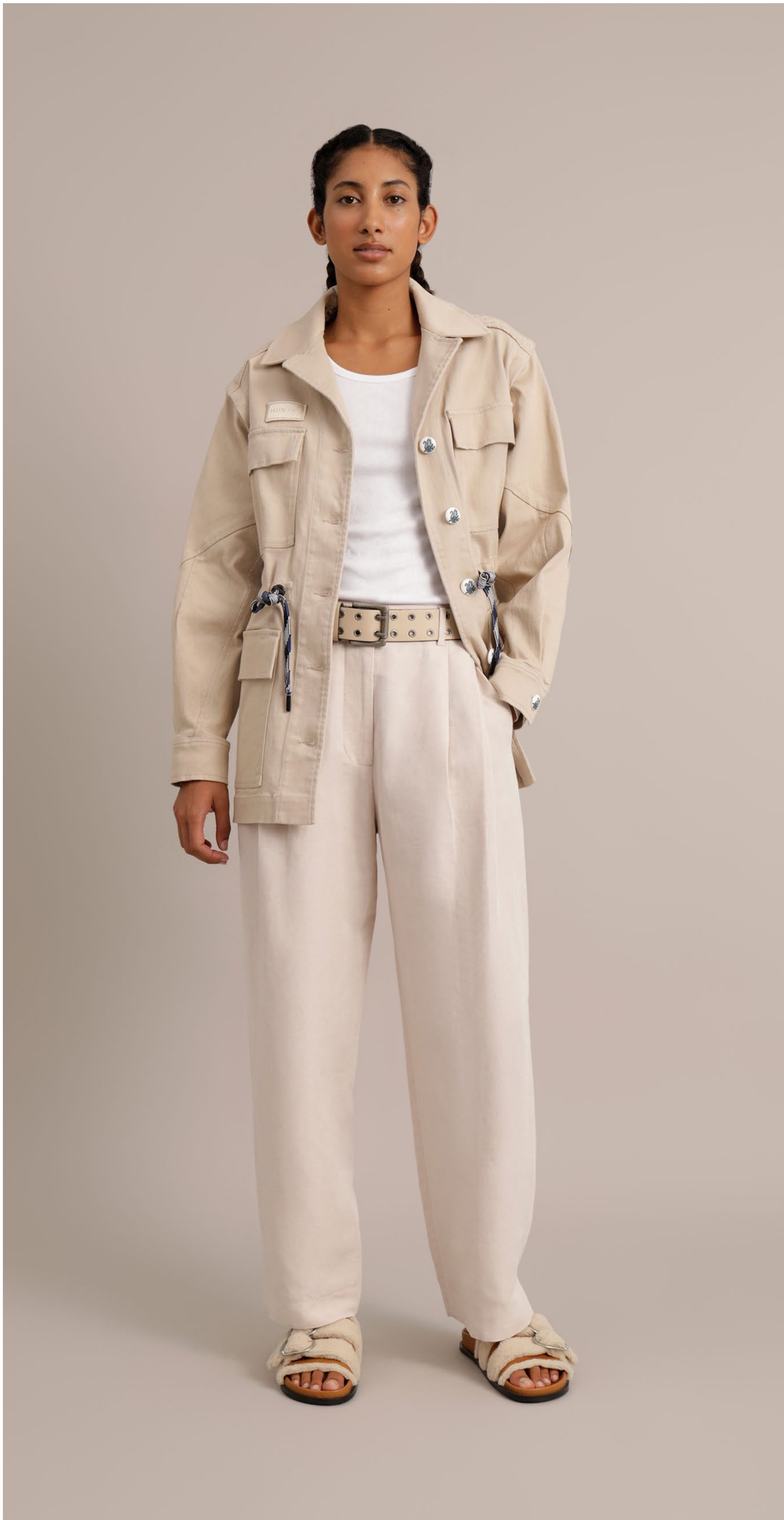
JACKET / UBART - TOP / CUTEST - BELT / CADEN - PANTS / UCANA SHOES / JEMMY