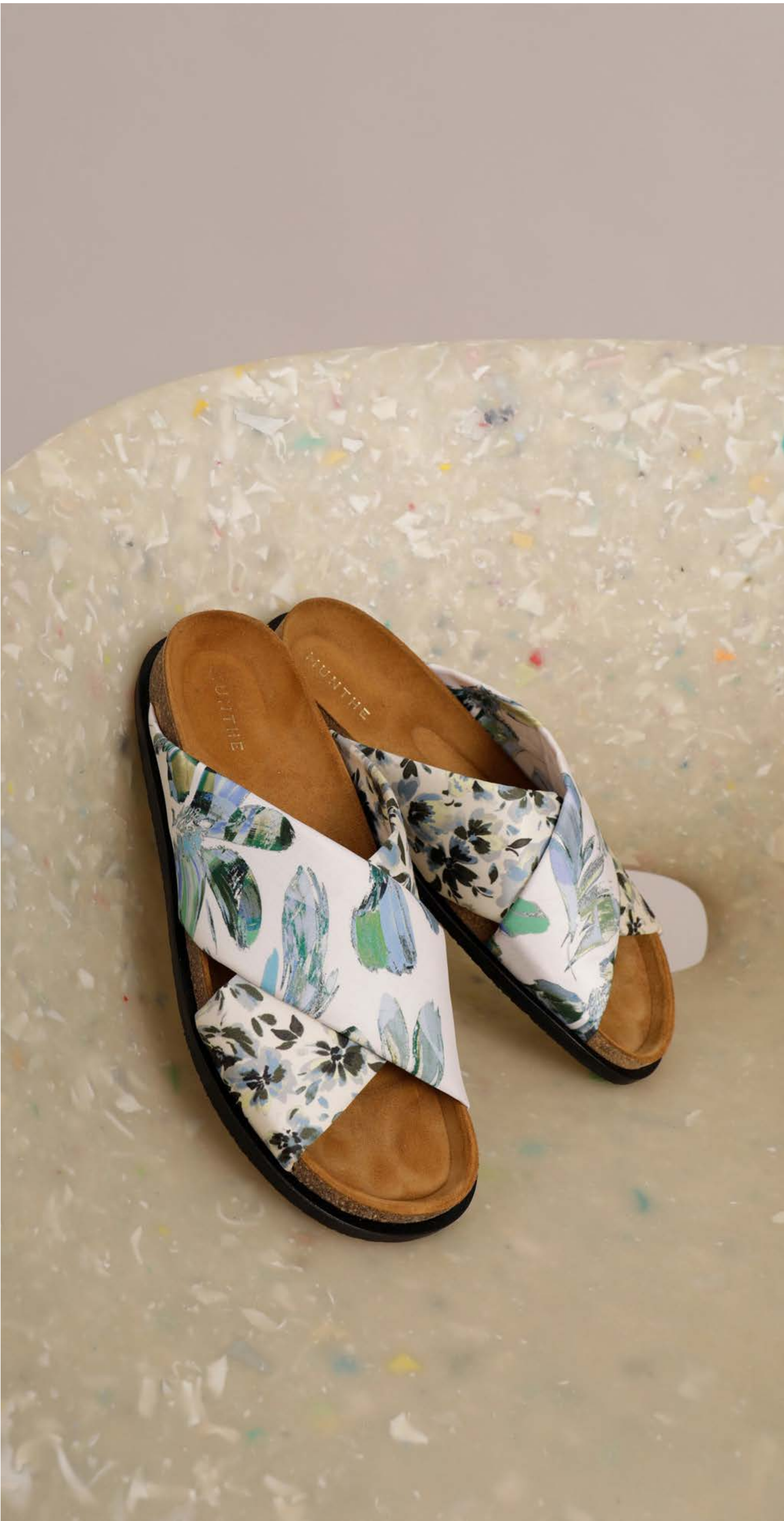
SHOES / UPON