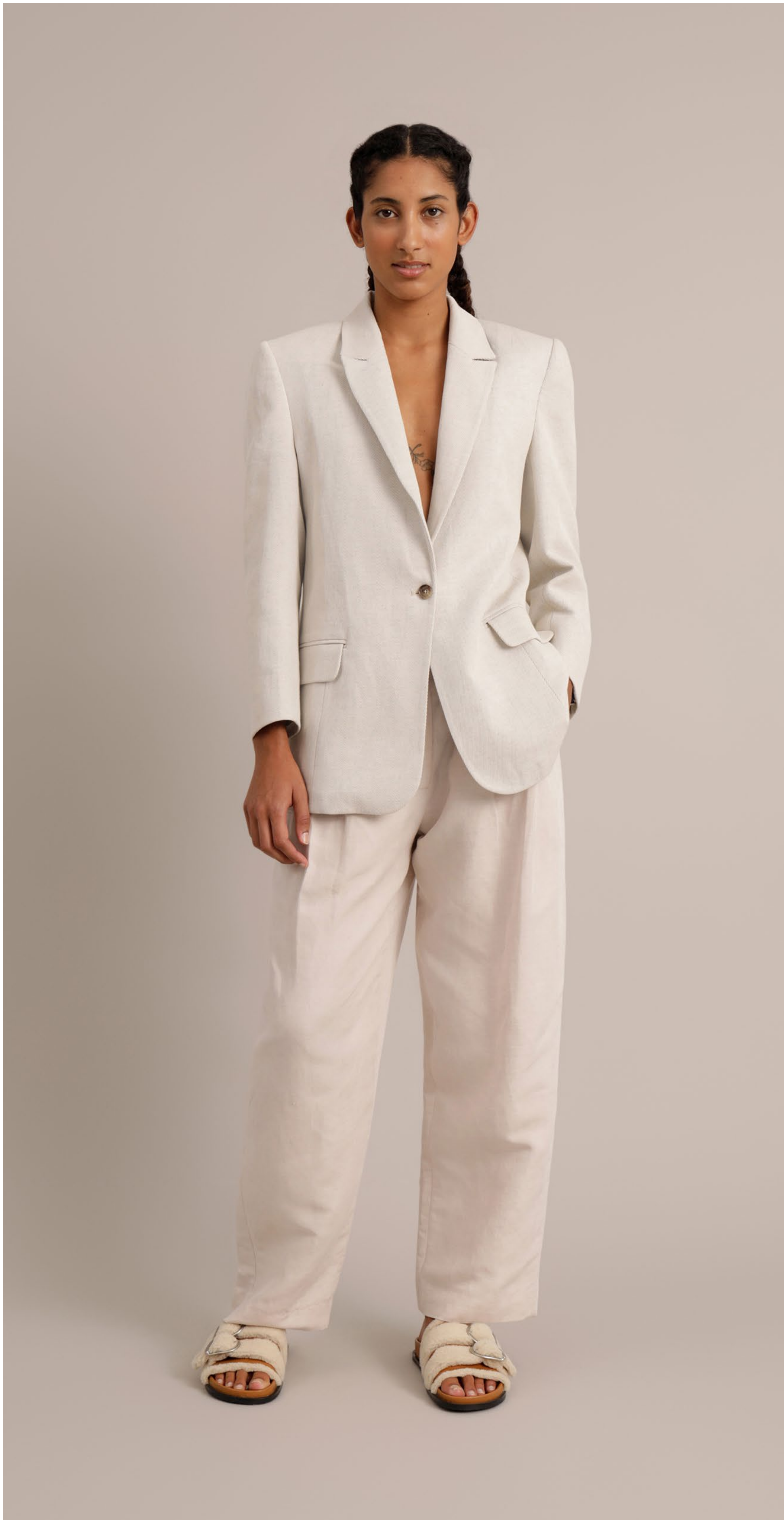
BLAZER / UBRE - PANTS / UCANA - SANDALS / JEMMY