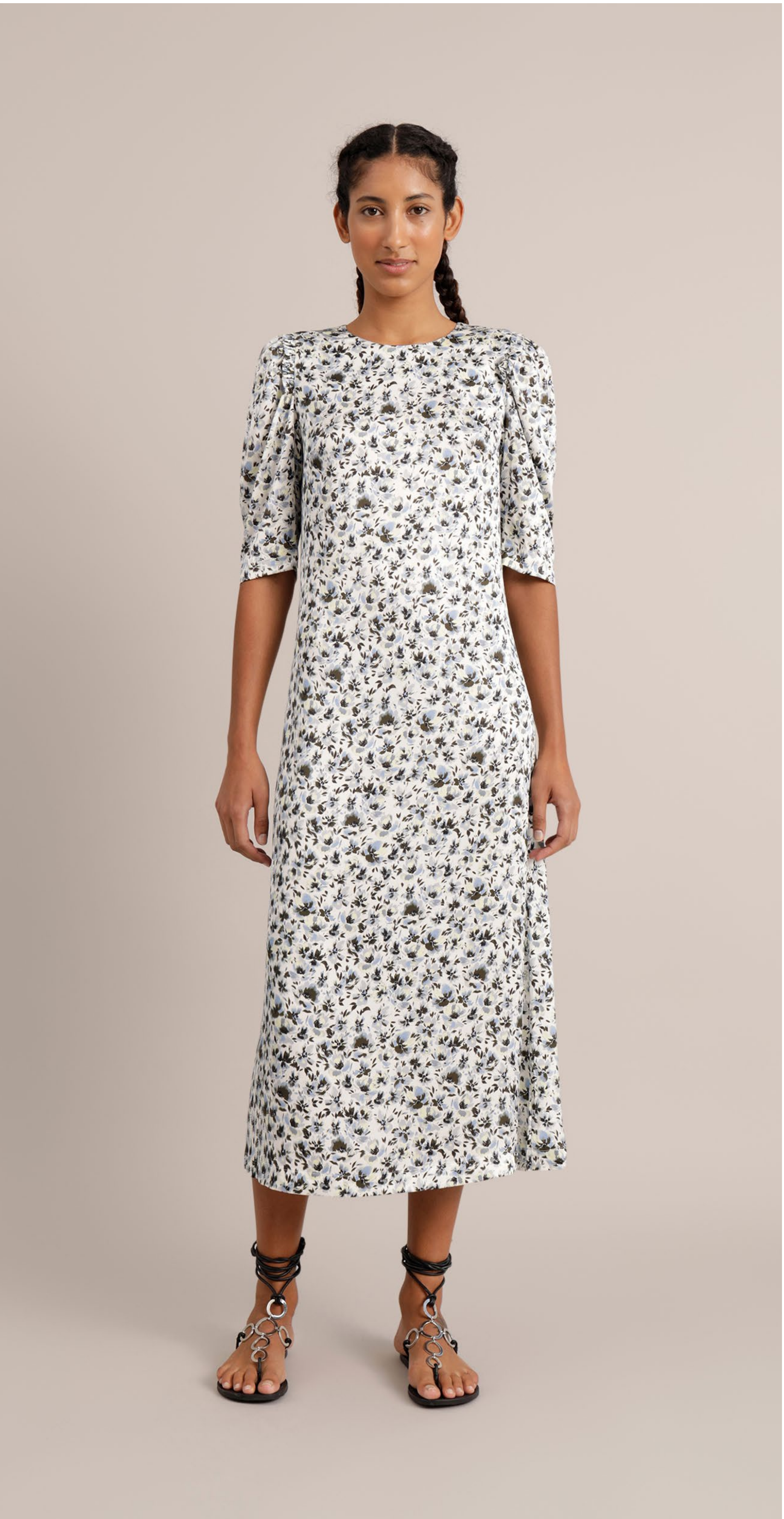
DRESS / UNIT