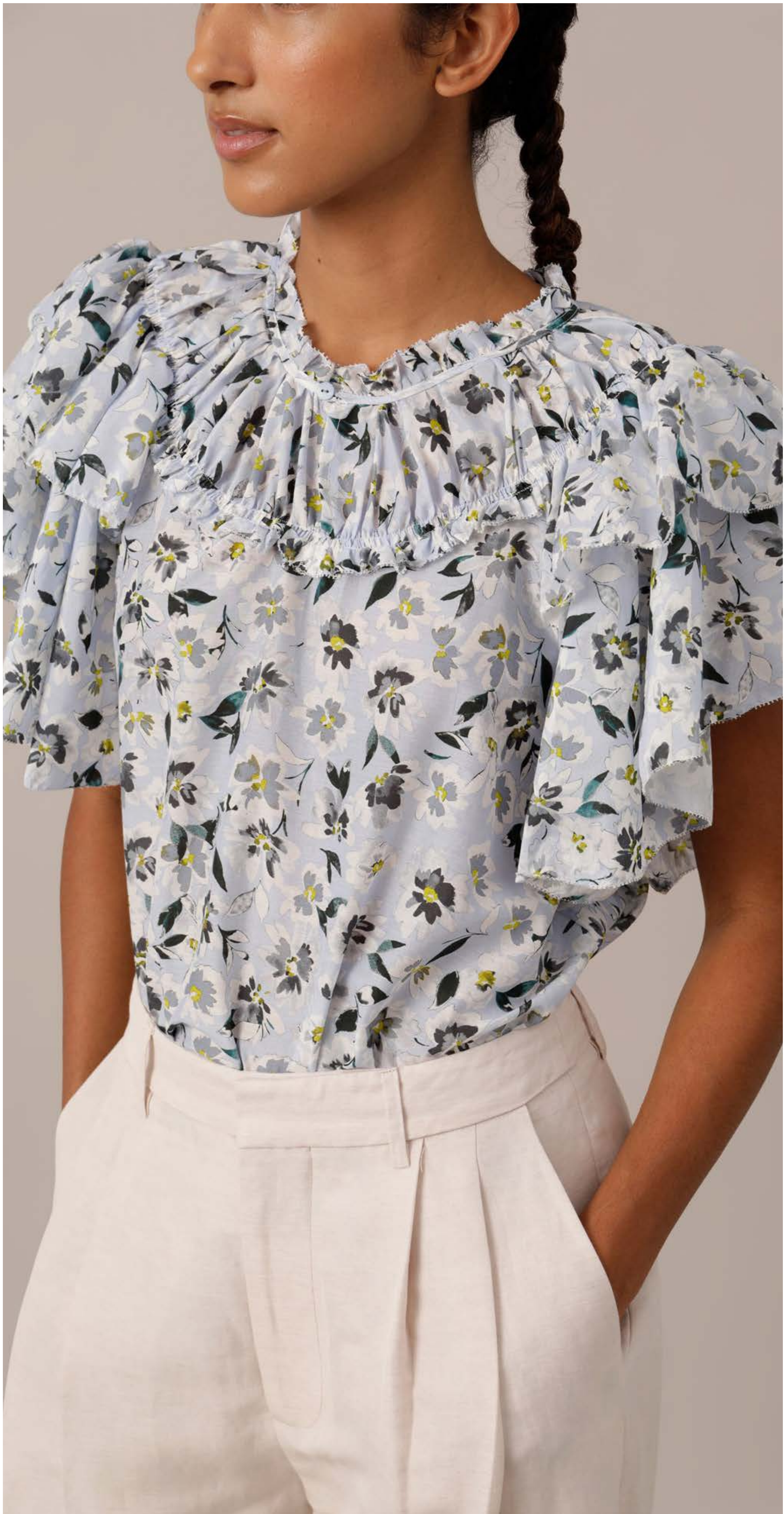
TOP / UCEA - PANTS / UCANA