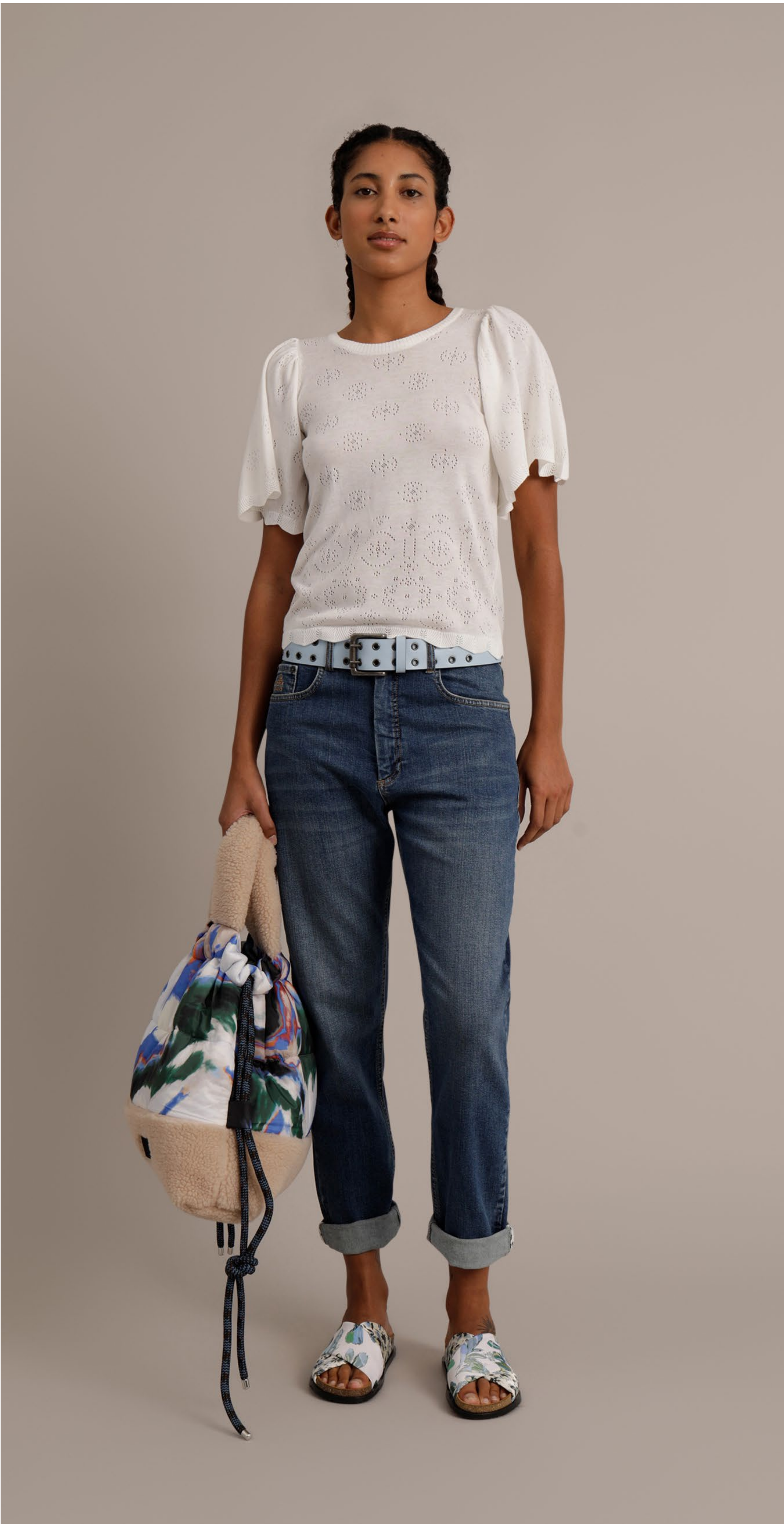
KNIT / UMALLEN - BELT / JADEN - JEANS / NAIOMIA - SHOES / UPON BAG / JOYOUS