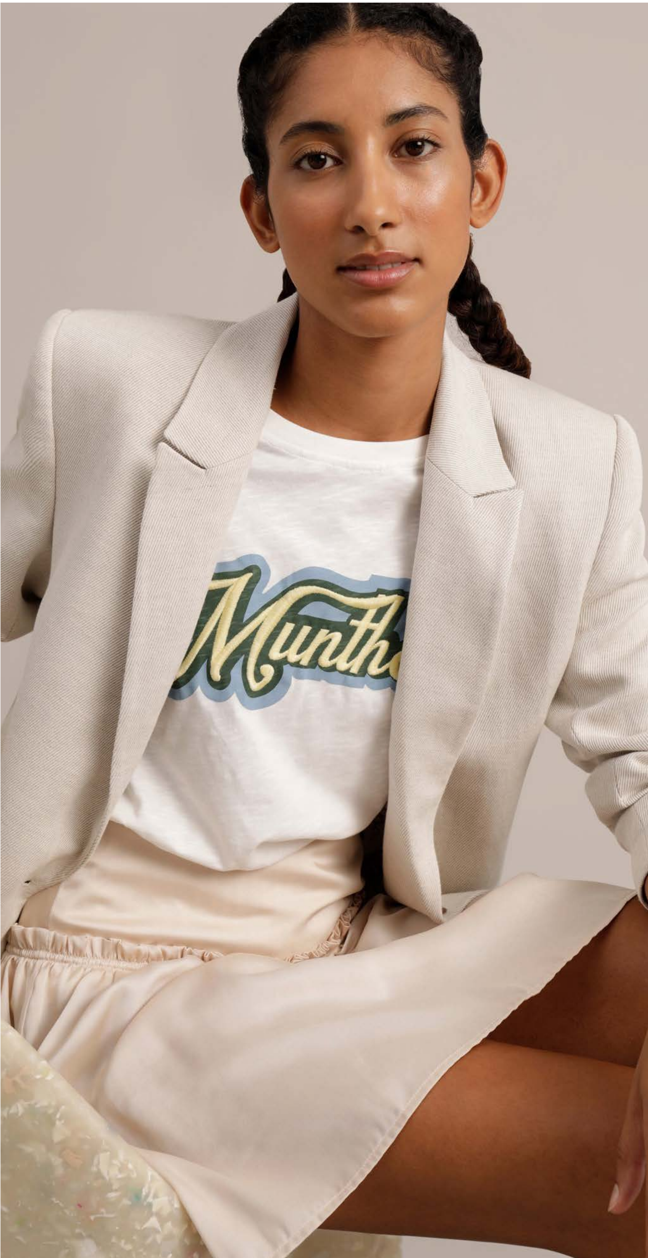
BLAZER / UBRE - T-SHIRT / HARP - SKIRT / ULTRAMI