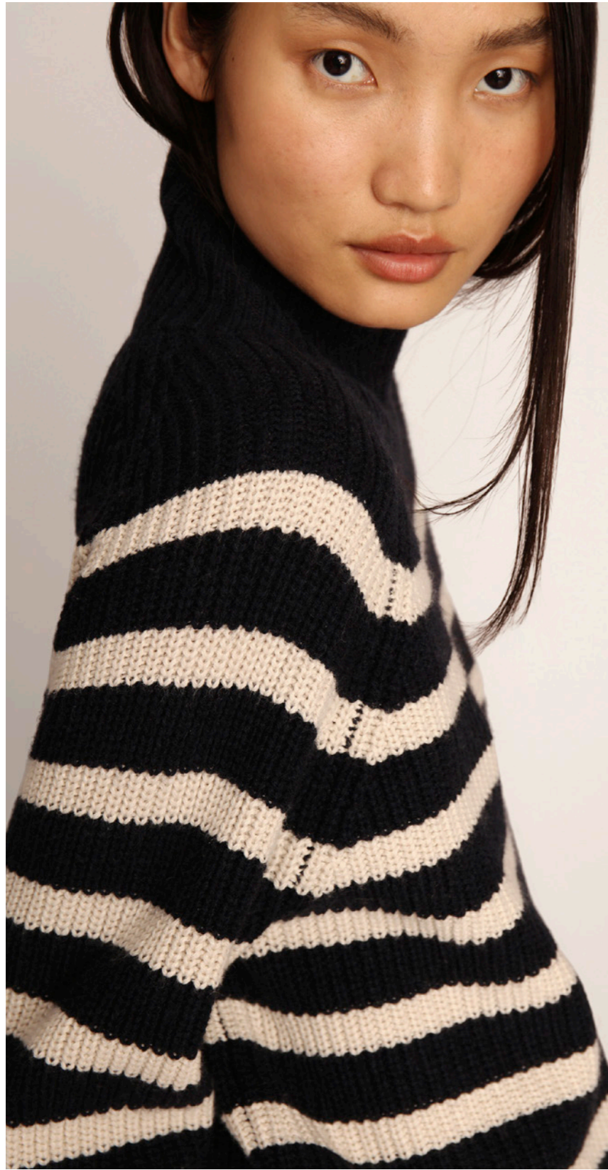
KNIT / ARISSA