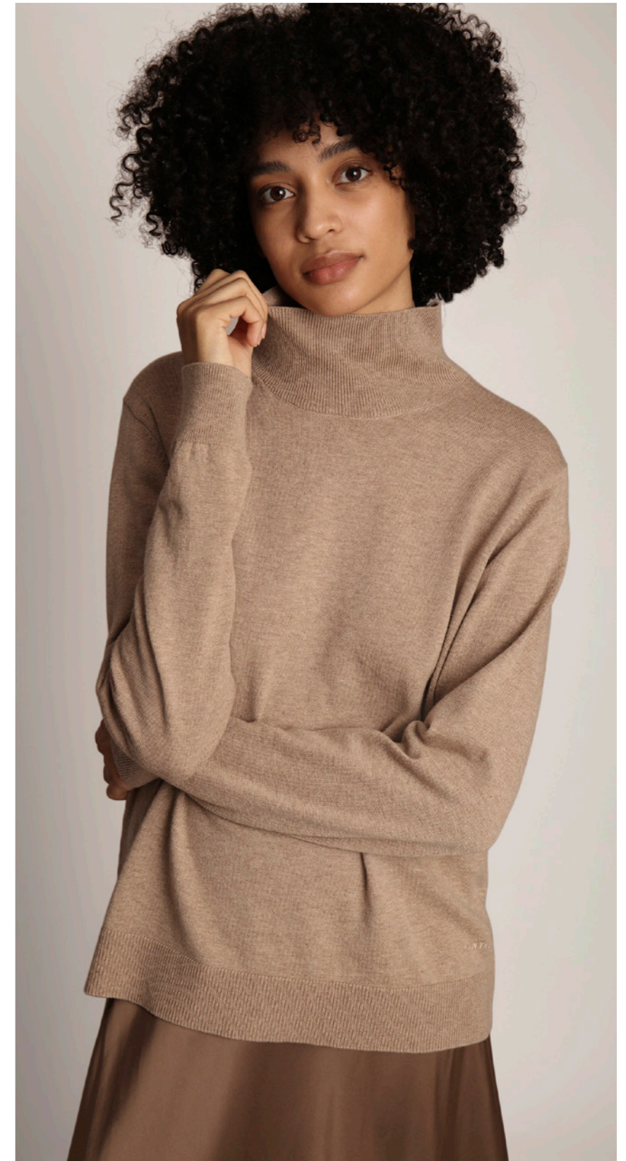
KNIT / GOLDBLOCK - SKIRT / BABE