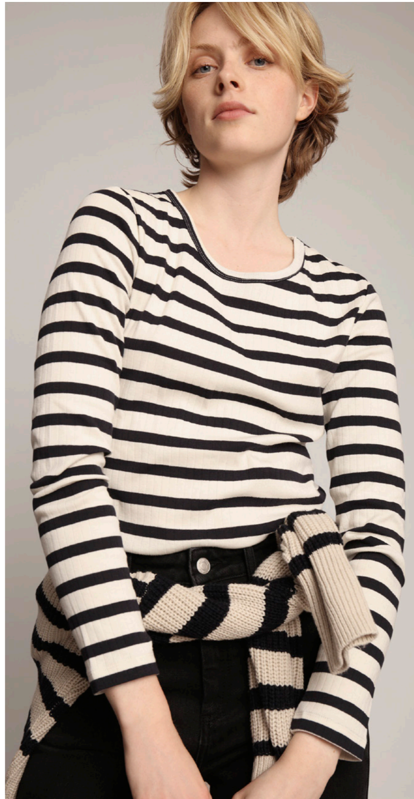
BLOUSE / JOTE - KNIT / ARISSA - JEANS / CULINARI