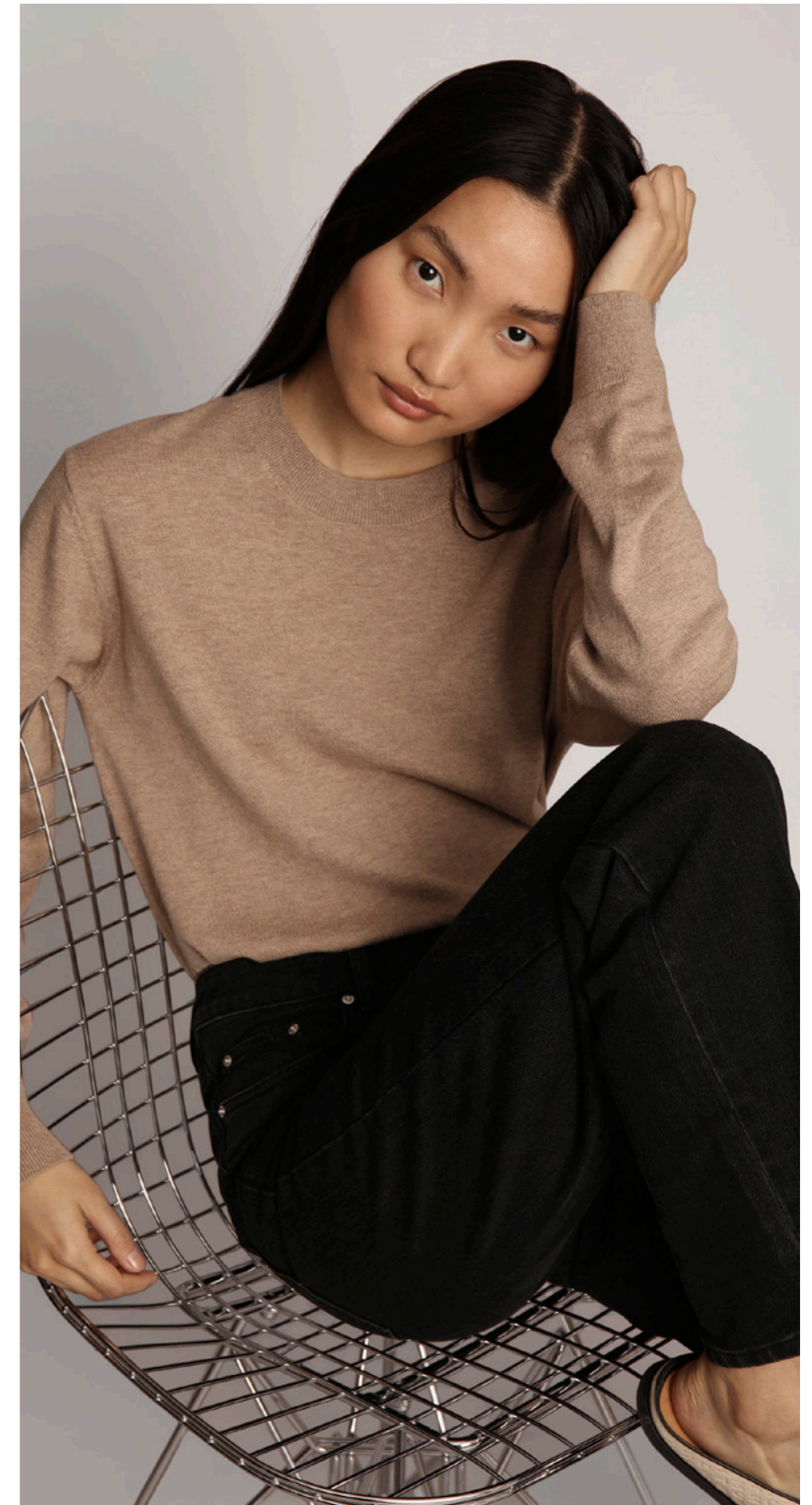
KNIT / SWELINA - JEANS / CULINARI