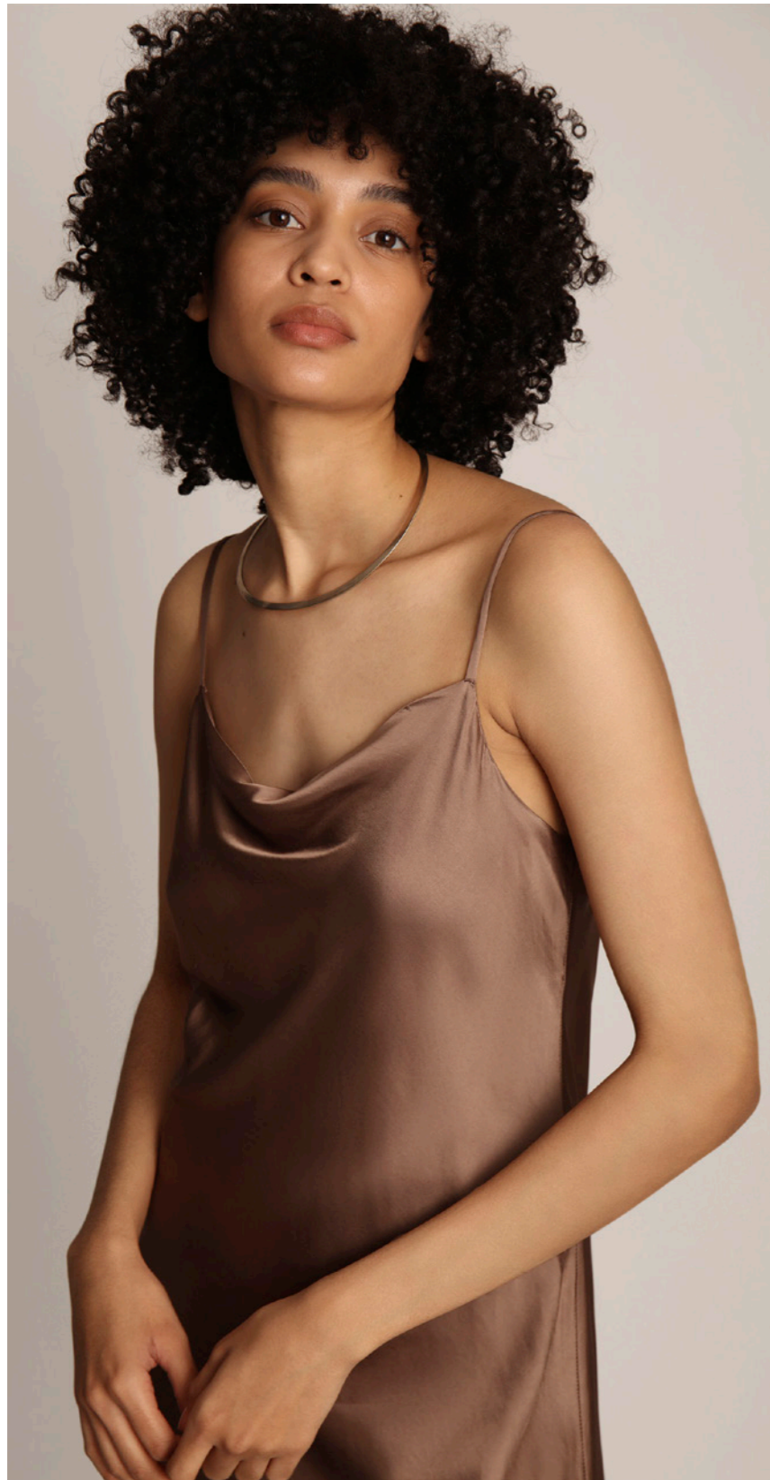
DRESS / BABYLOMA