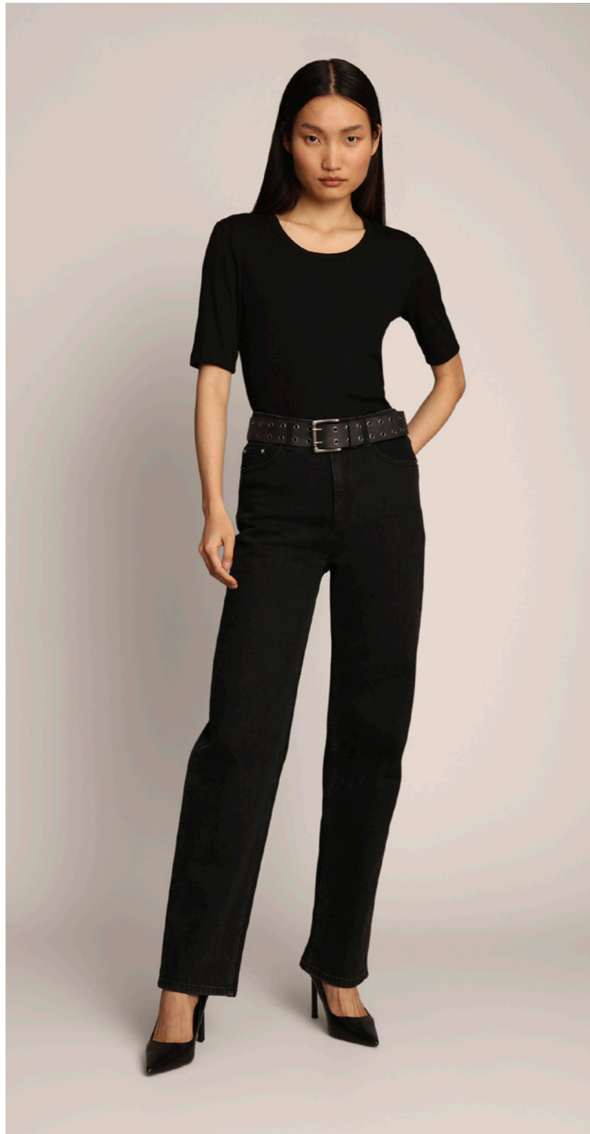
BLOUSE / MUTULA - JEANS / CULINARI - BELT / CADEN