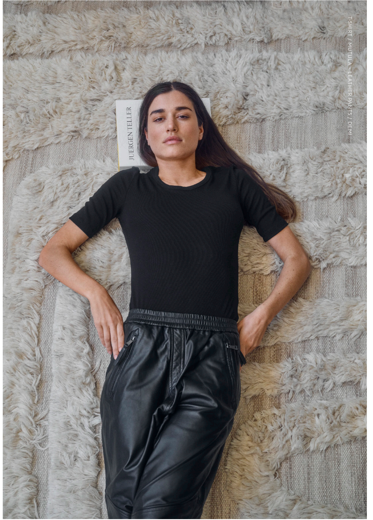
T-SHIRT / MUTULA - LEATHER PANTS / DEMI