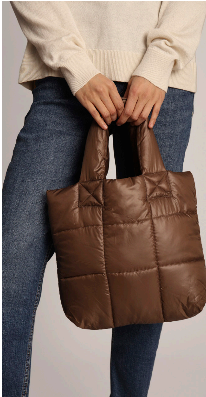
KNIT / GOLDBLOCK - JEANS / KIMMY - BAG / MILLA