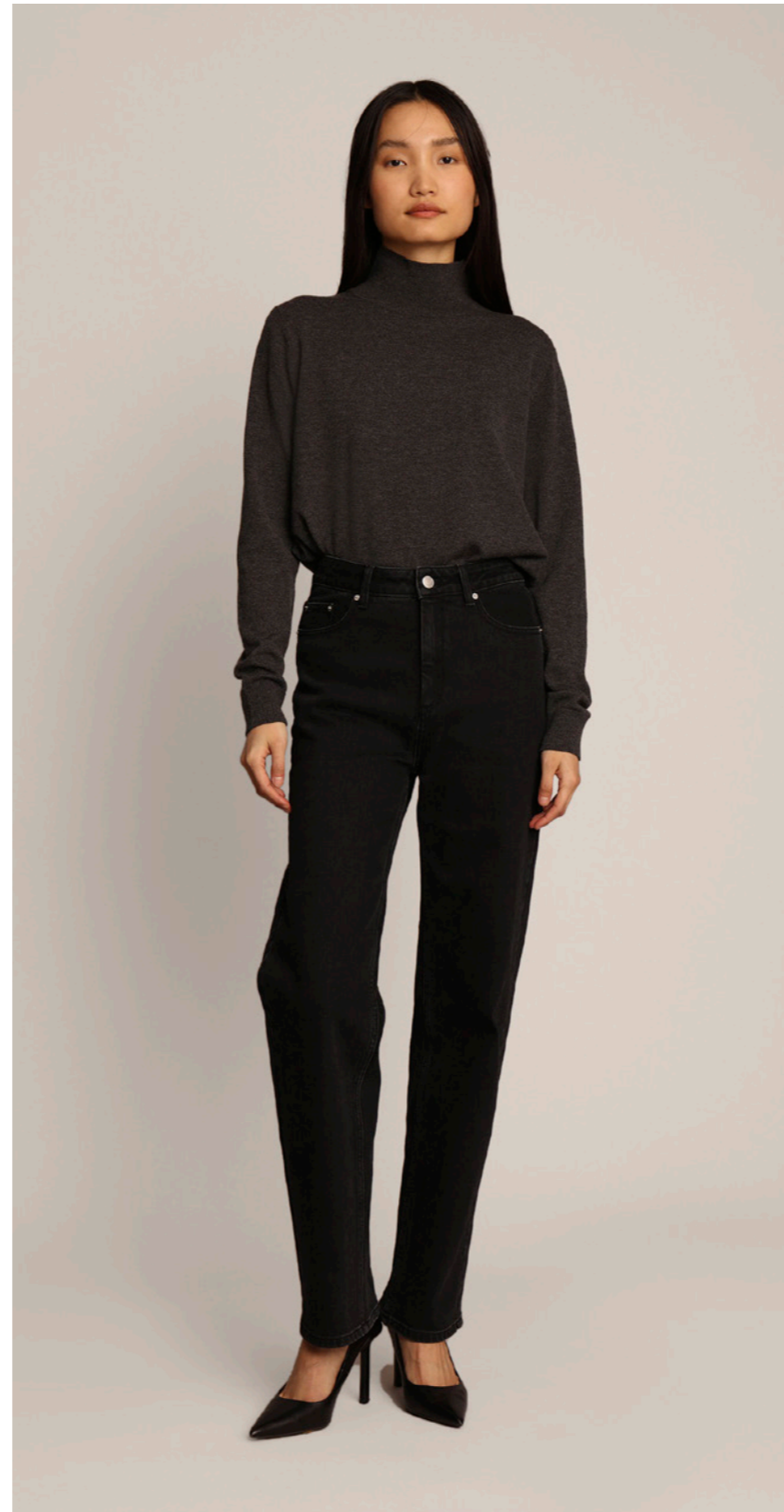
BLOUSE / GOLDBLOCK - JEANS / CULINARI