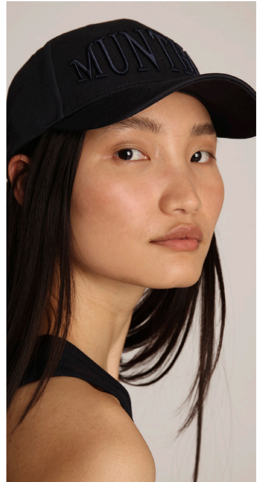
TOP / PEACH - HAT / JEWEL