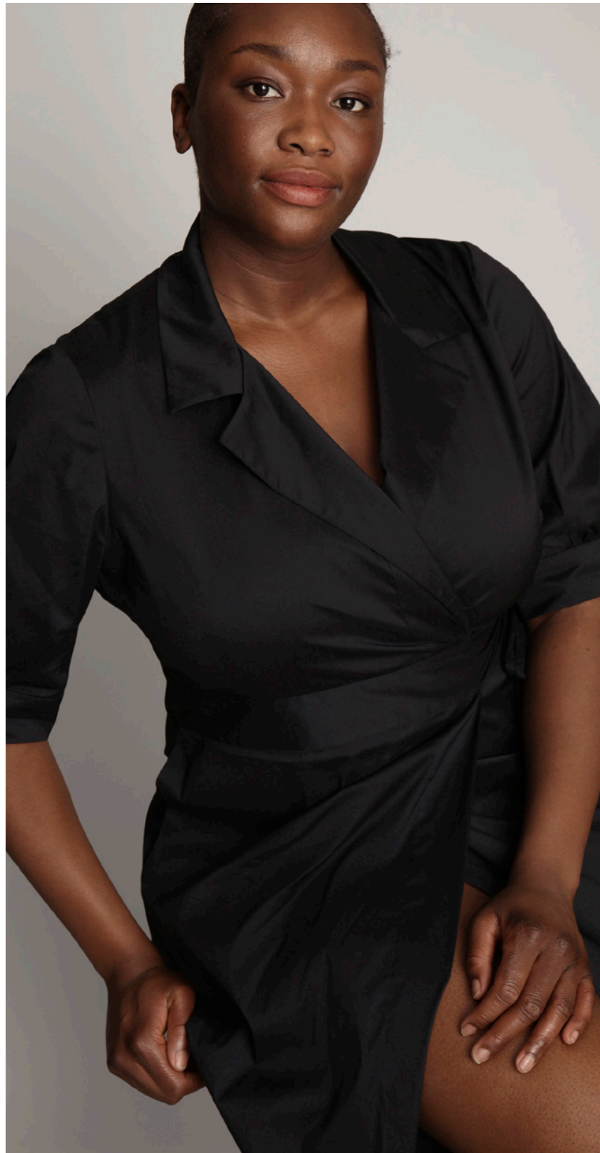
DRESS / BOBULA