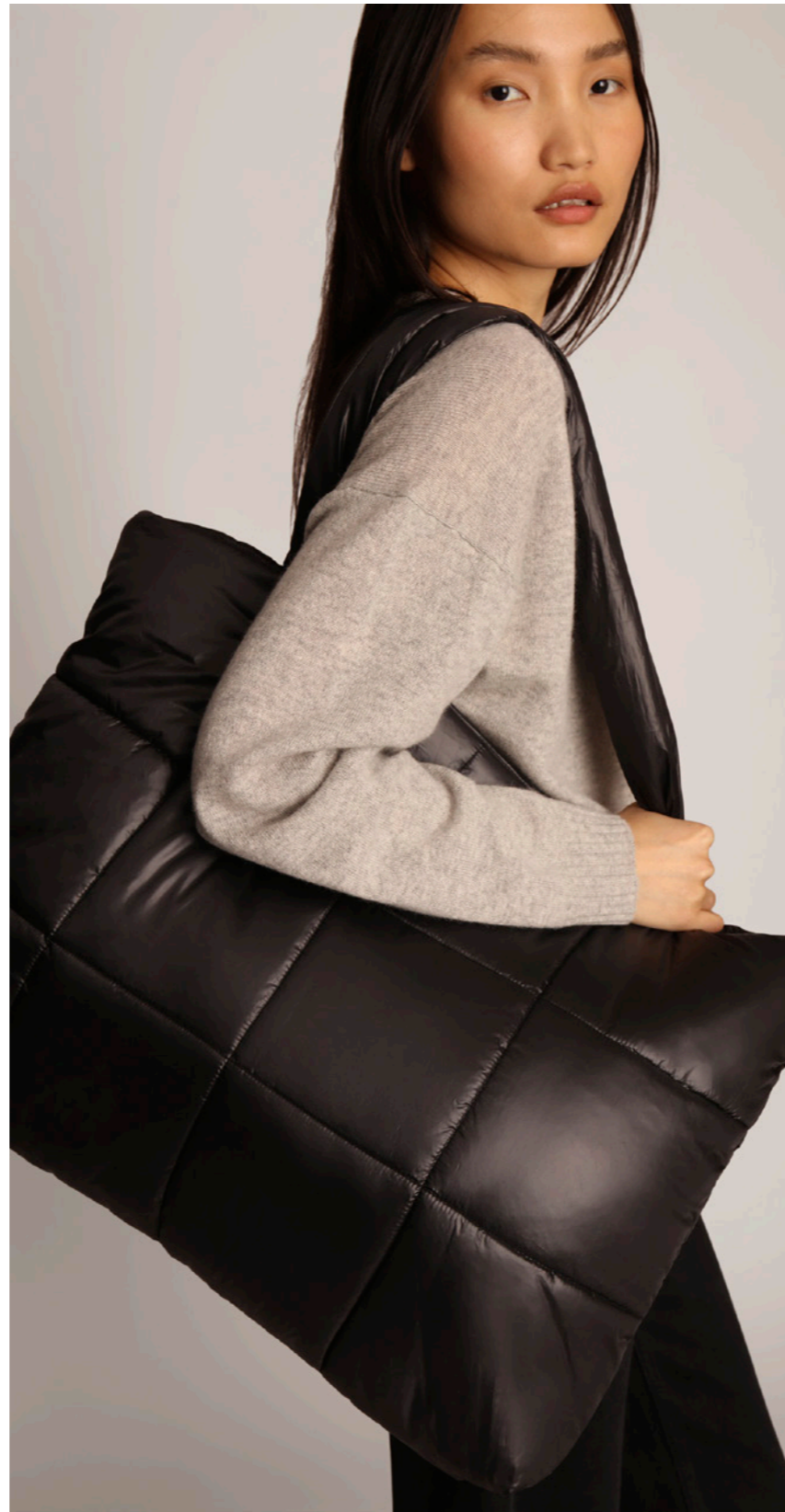
KNIT / KIARAN - JEANS / CULINARI - BAG / MARILYN