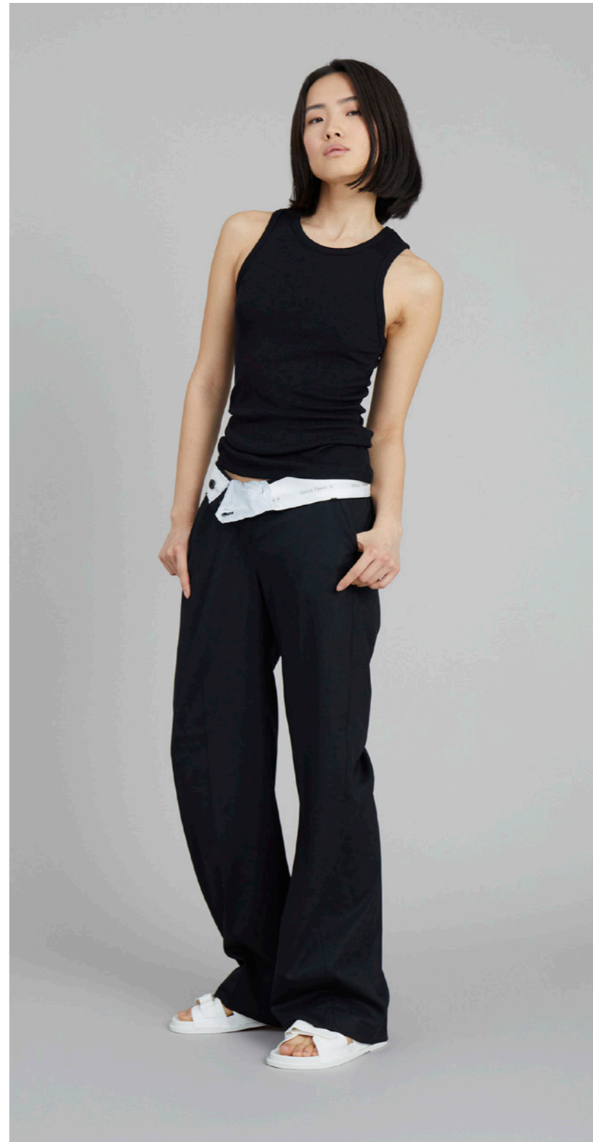
TOP / PEACH - PANTS / SUMATRA