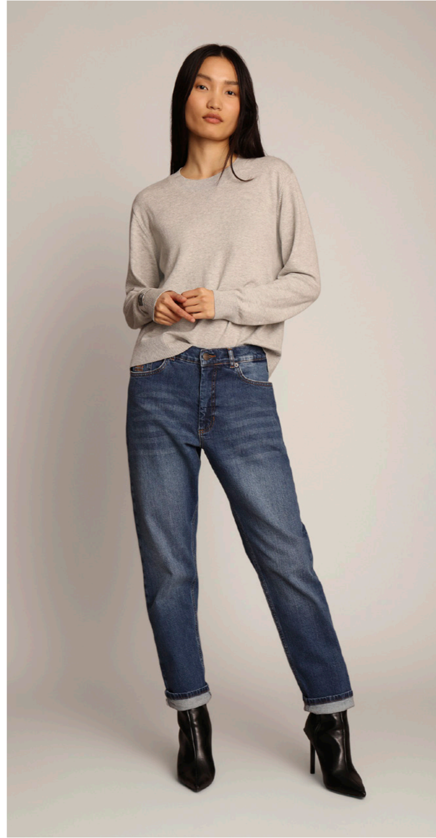
KNIT / SWELINA - JEANS / NAIOMIA