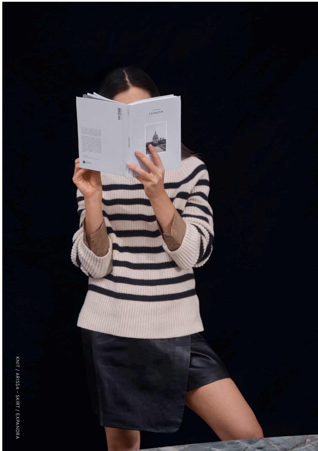
KNIT / ARISSA - SKIRT / EXPANDRA