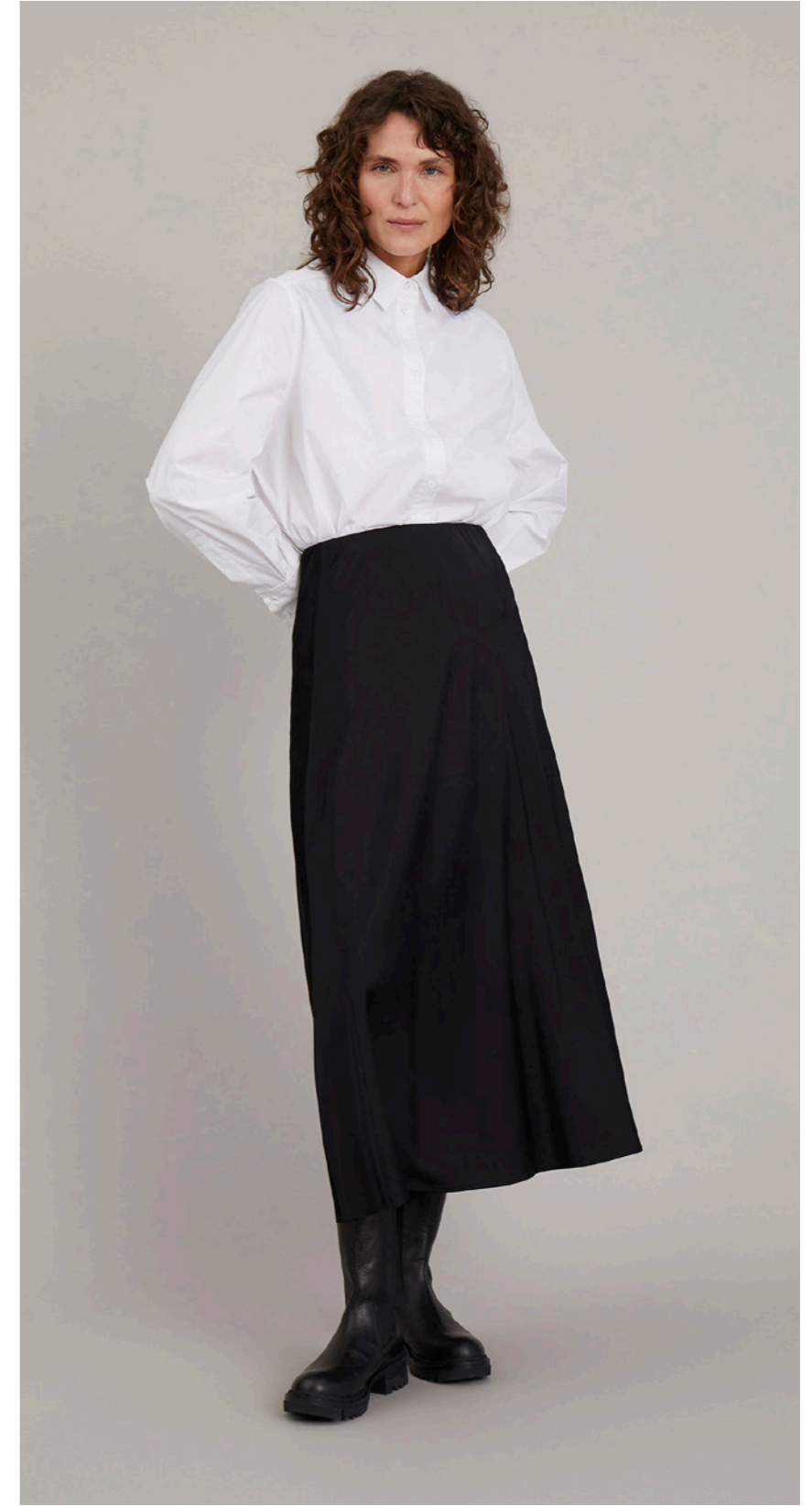
BLOUSE / HOLLIA - SKIRT / BABE