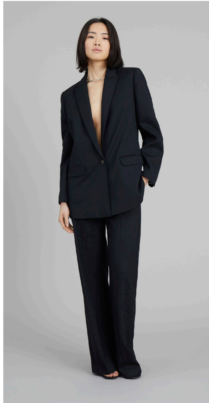
BLAZER / SUSSIMA - PANTS / SUMATRA