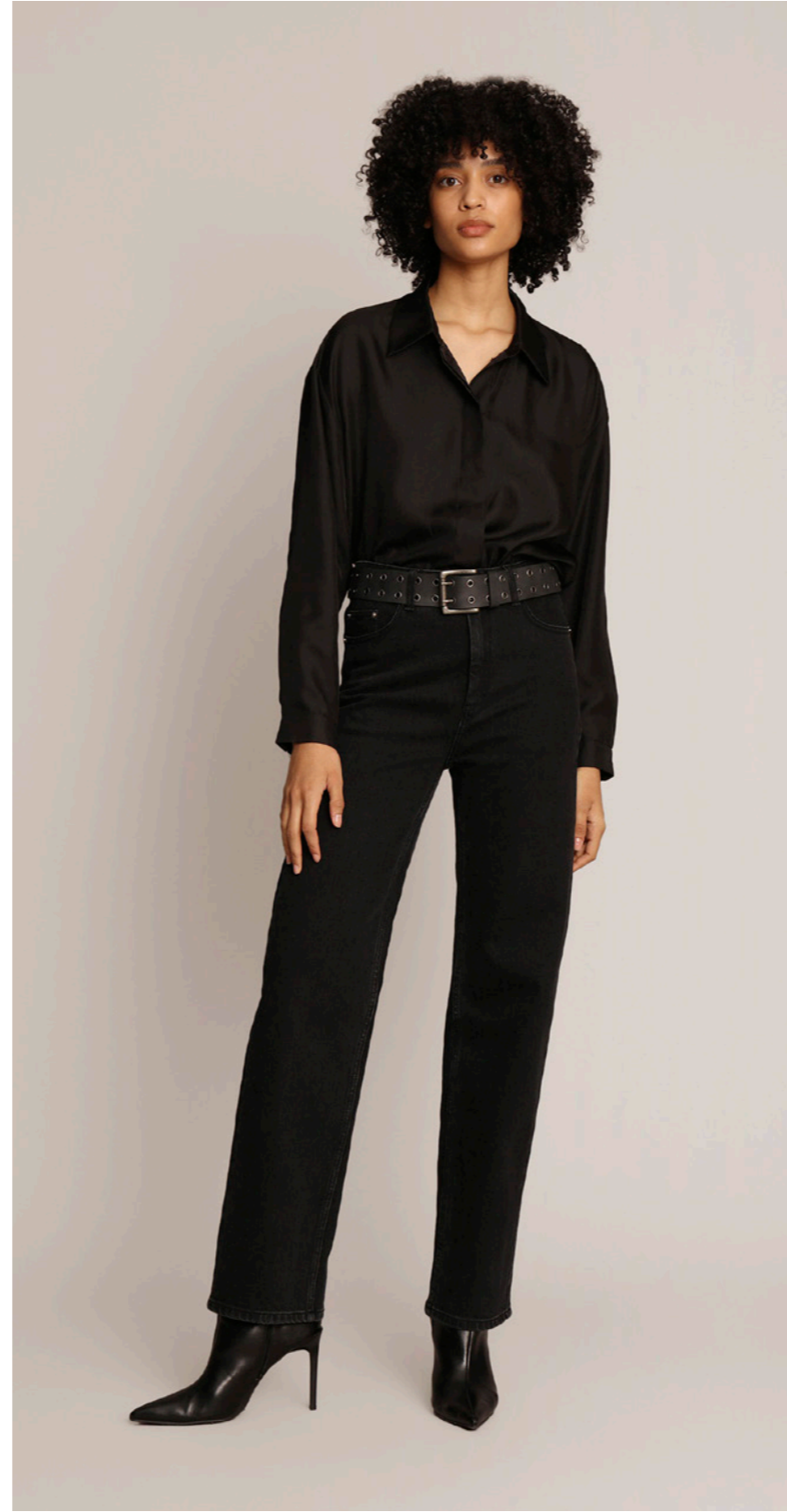
BLOUSE / LALALU - JEANS / CULINARI - BELT / CADEN