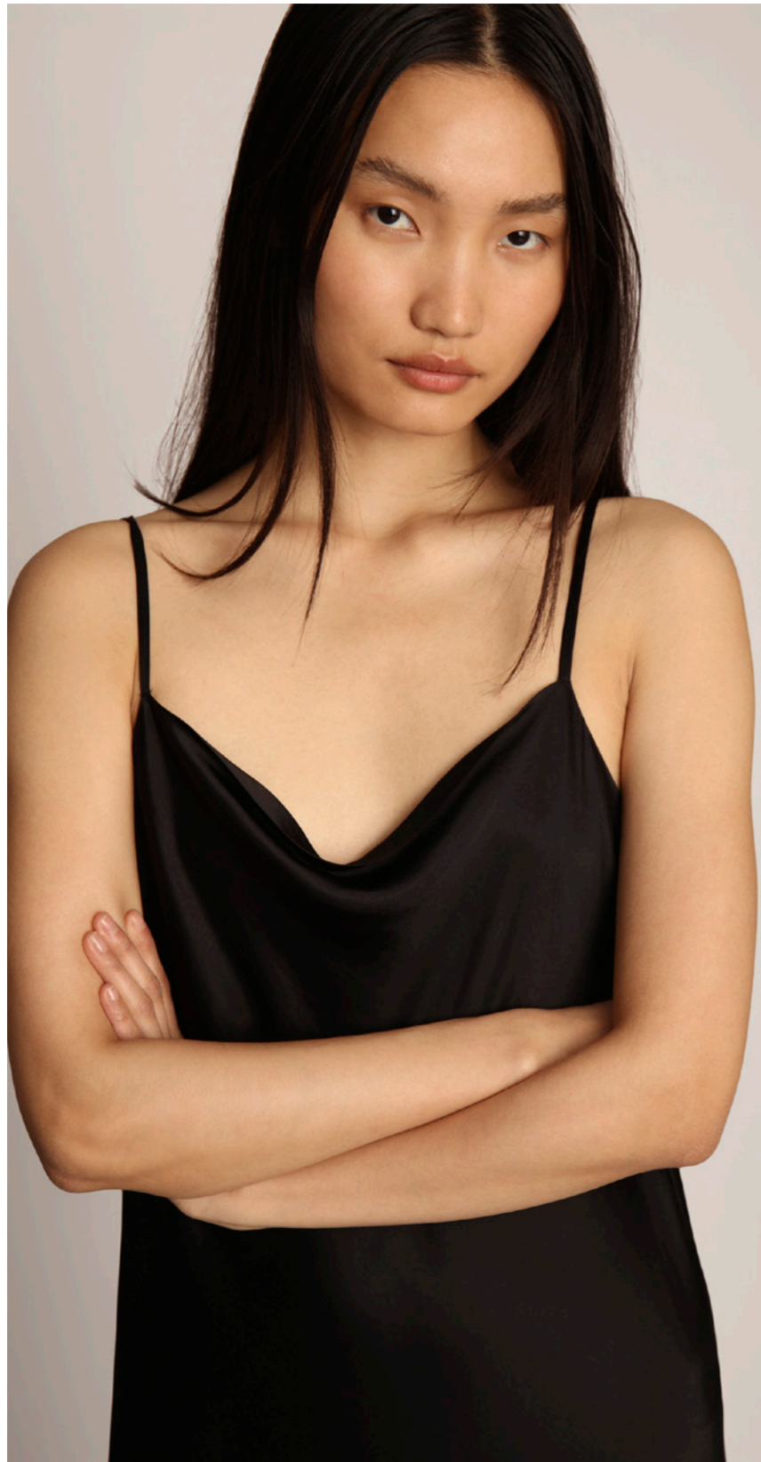
DRESS / BABYLOMA