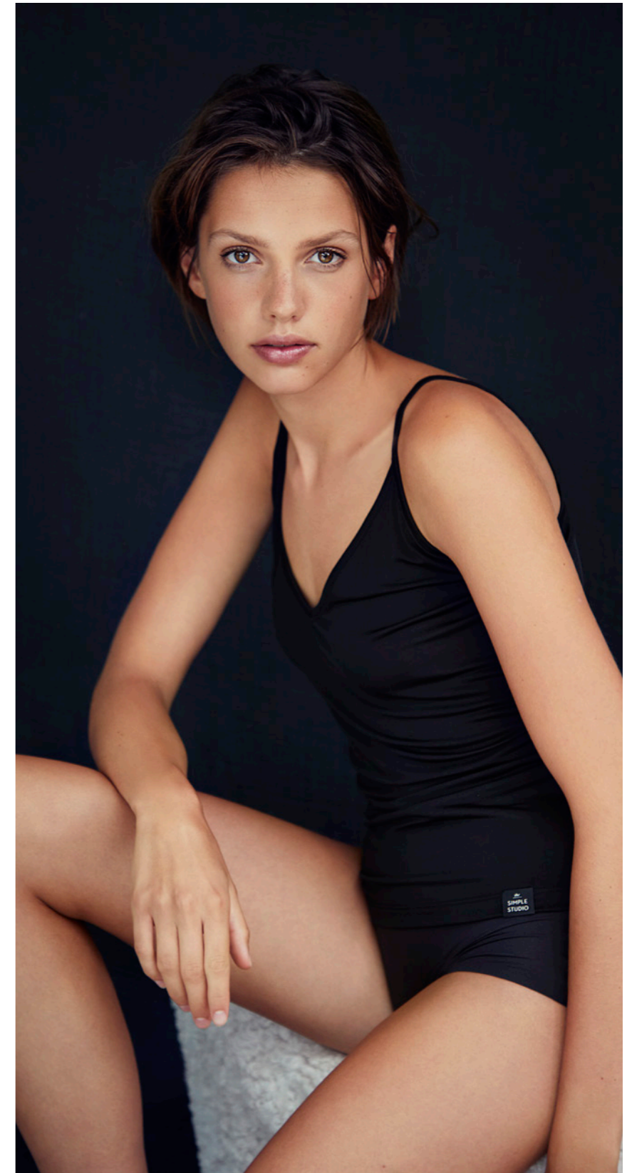
TOP / DEAREST