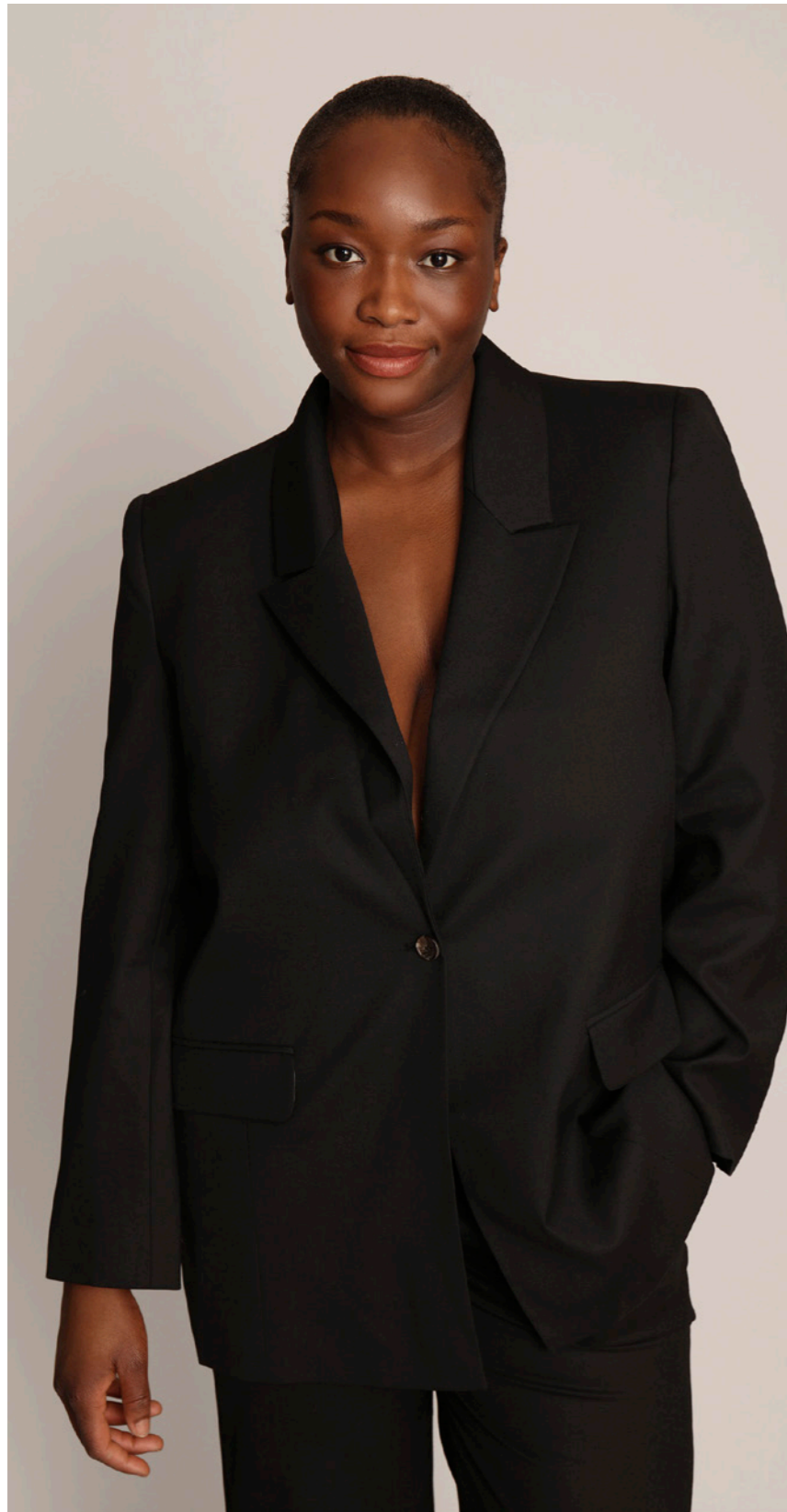
BLAZER / SUSSIMA - PANTS / SUMATRA