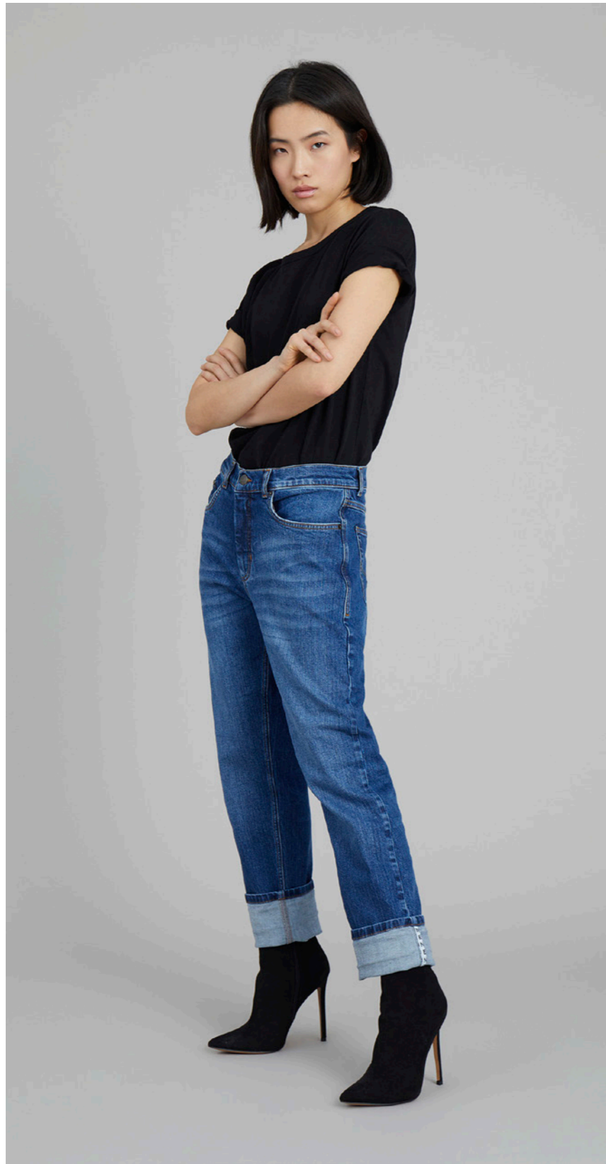
T-SHIRT / JULIANCO - JEANS / NAIOMIA