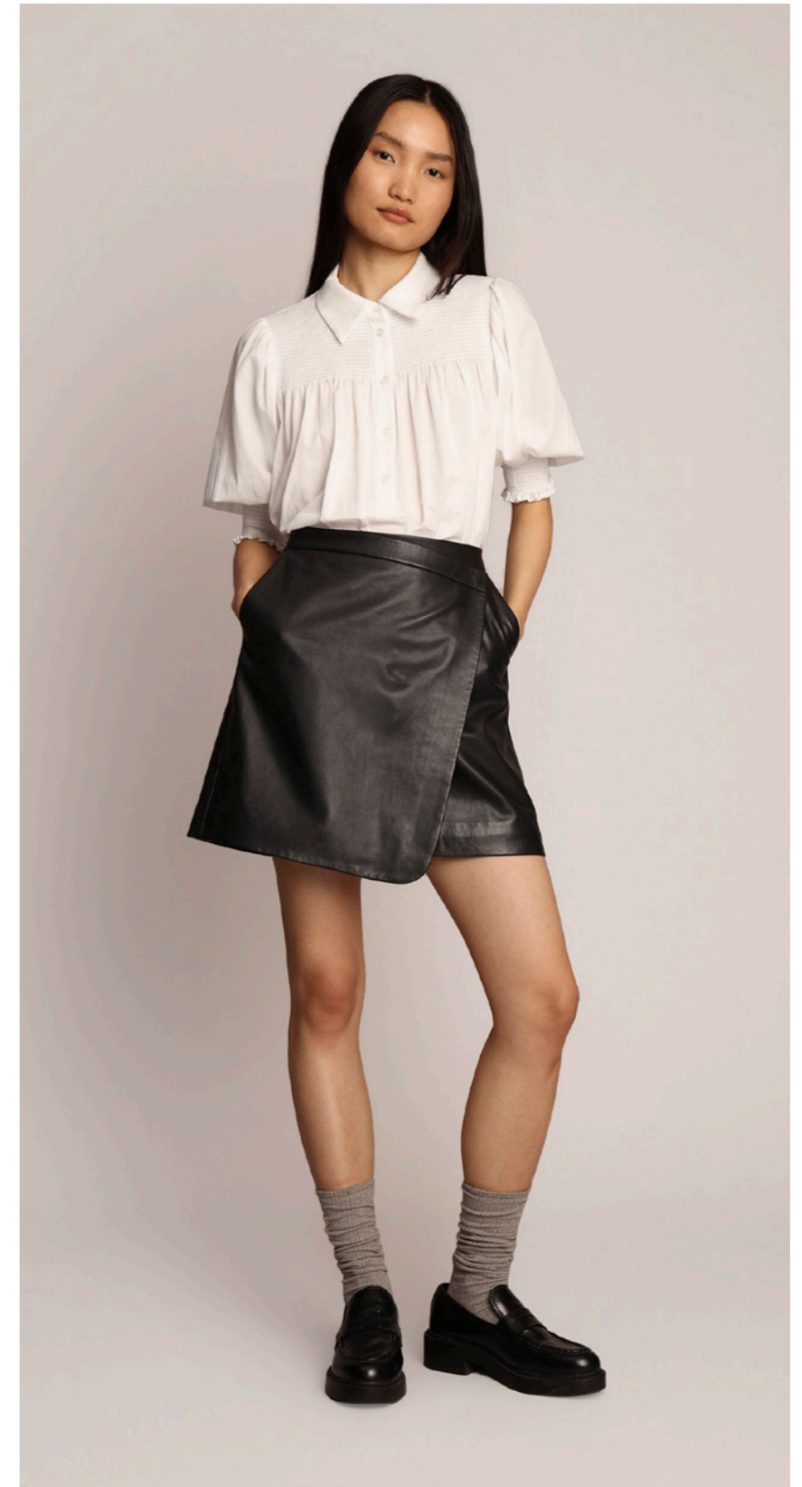
BLOUSE / CHAPTER - SKIRT / EXPANDRA - SOCKS / GAKAN