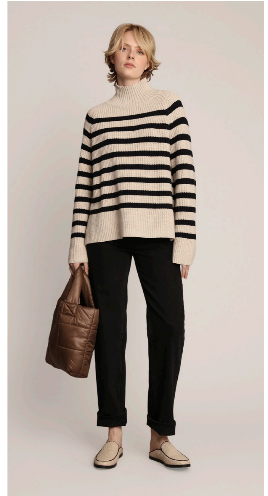
KNIT / ARISSA - PANTS / CULINARI - BAG / MARILYN