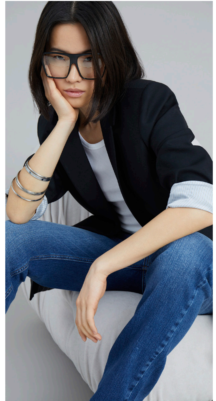
TOP / PEACH - BLAZER / SUSSIMA - JEANS / KIMMY