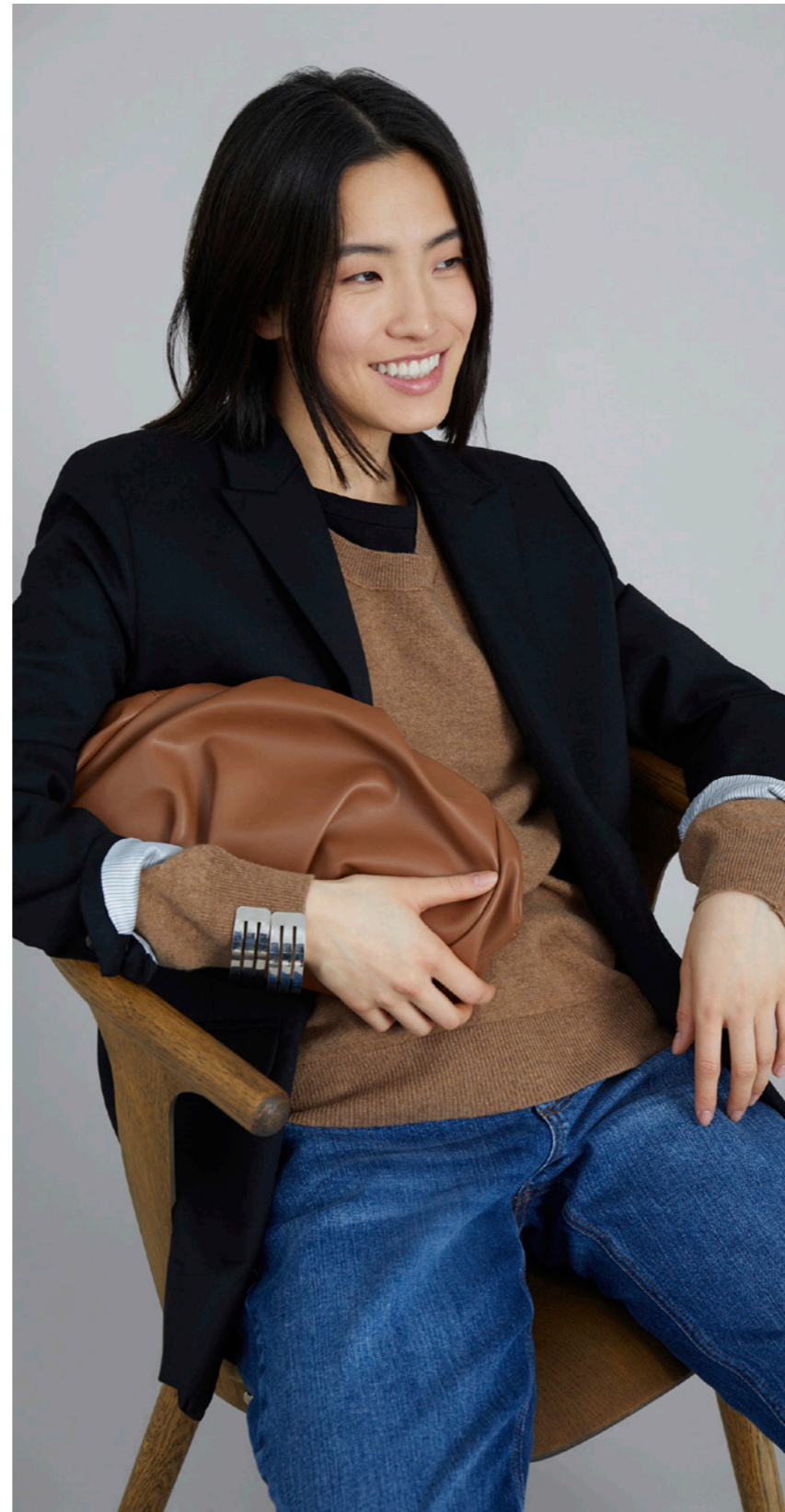
BLAZER / SUSSIMA - BLOUSE / CUTEST - KNIT / KIARAN - JEANS / NAIOMIA