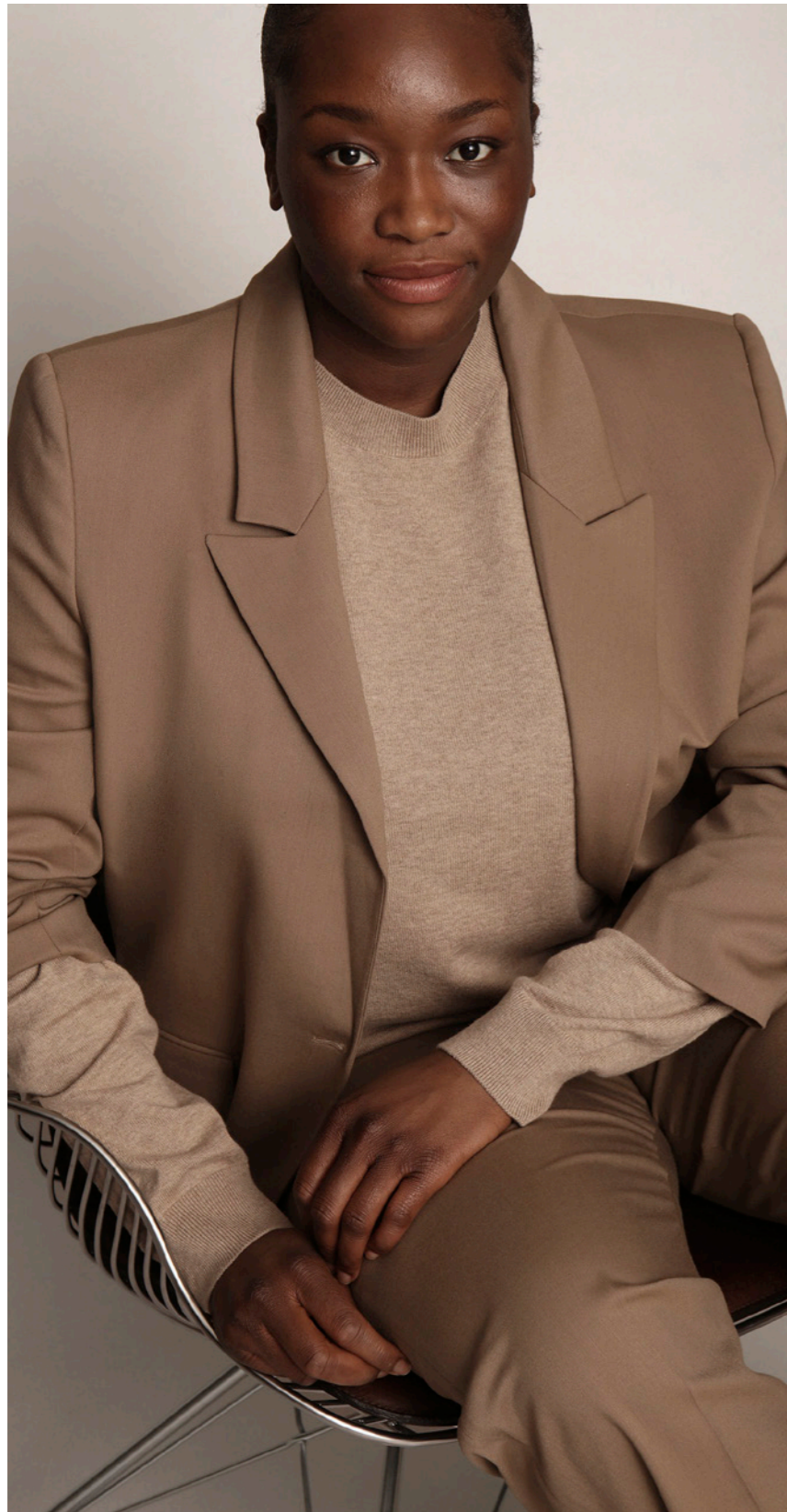
BLAZER / SUSSIMA - KNIT / SWELINA - PANTS / SUMATRA