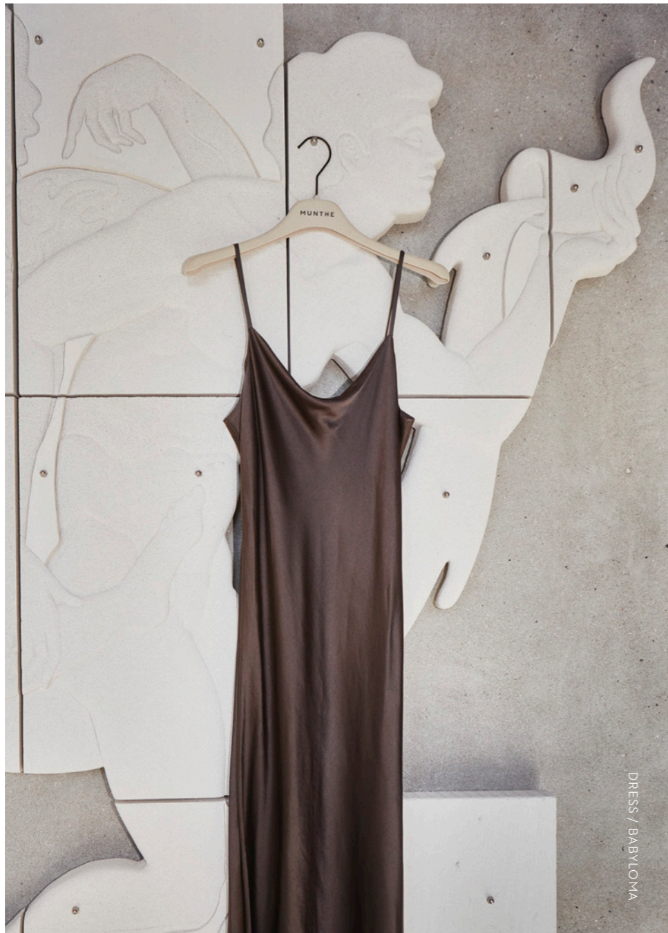
The signature go-to styles that always make you feel beautiful and comfortable whether you are casually lounging at home or going out.