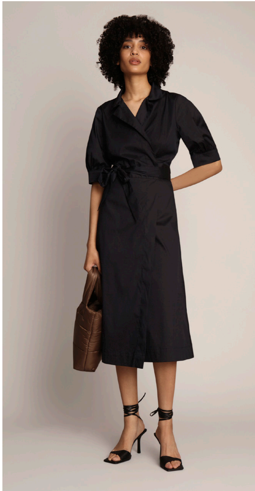
DRESS / BOBULA - BAG / MILLA