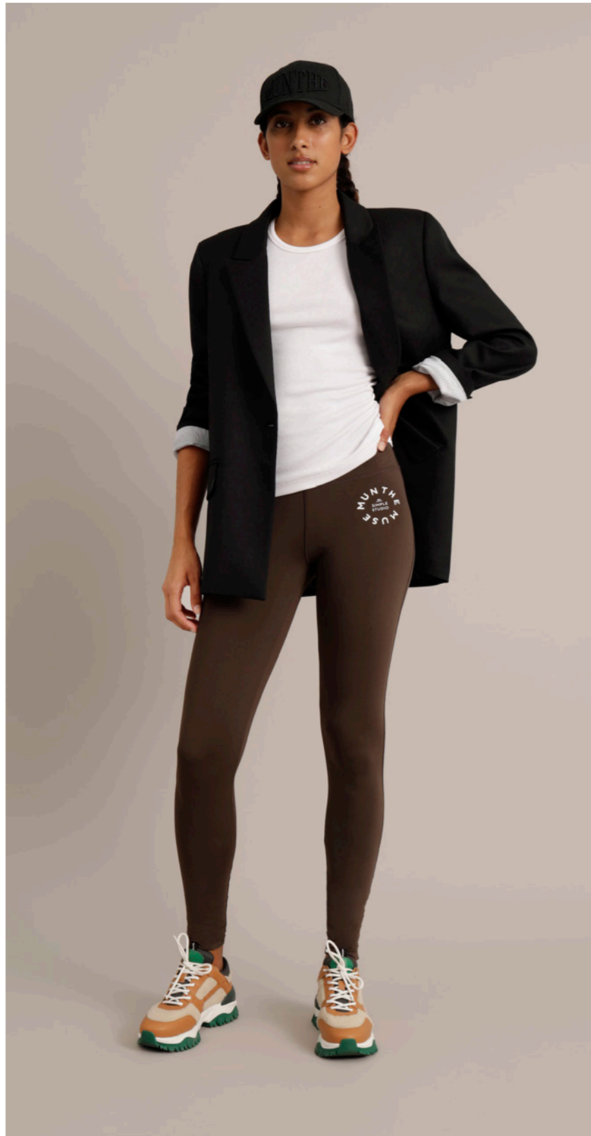
BLAZER / SUSSIMA - TOP / PEACH - PANTS / SANDY - HAT / JEWEL