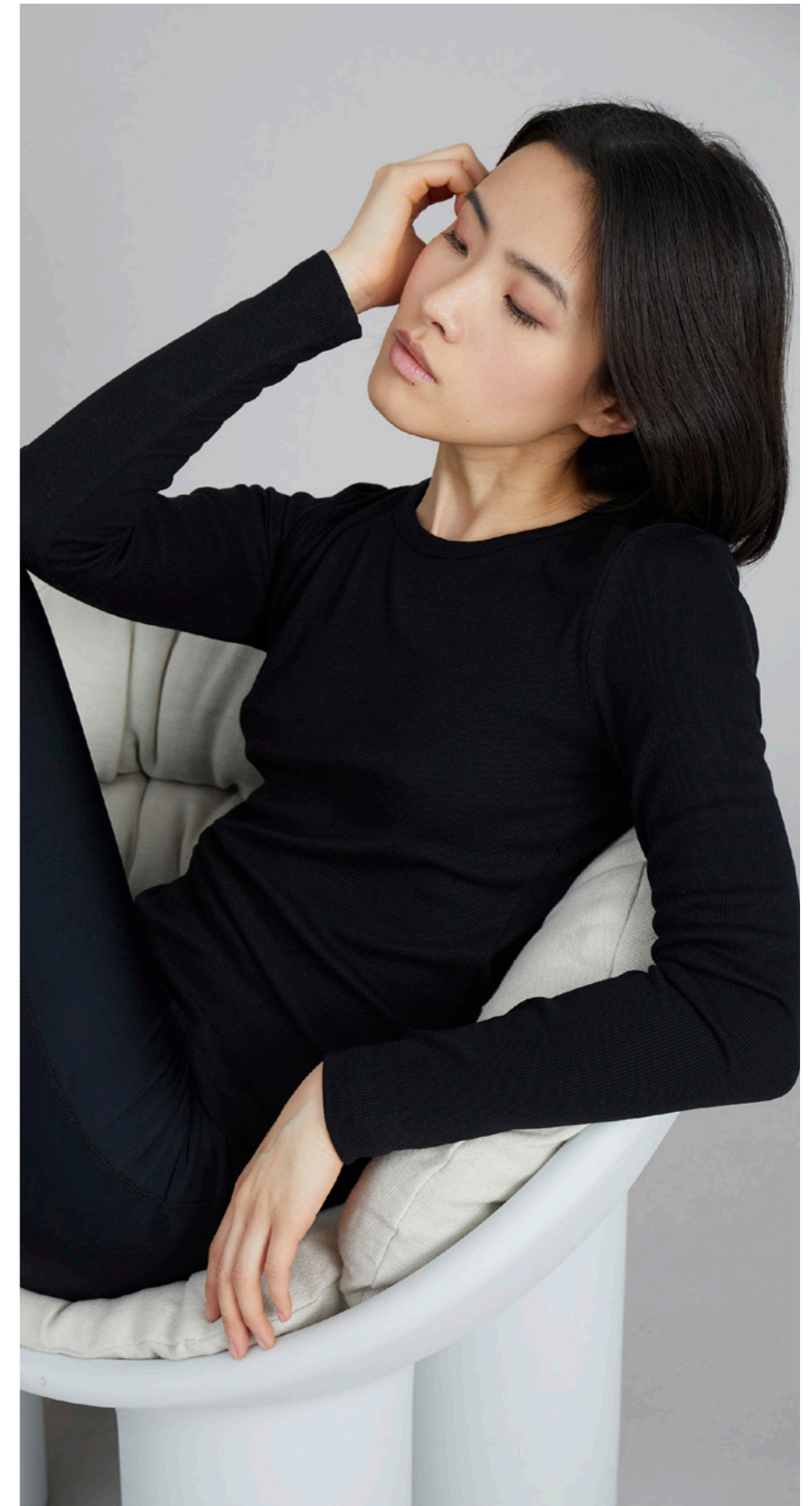
BLOUSE / CUTEST - PANTS / SANDY