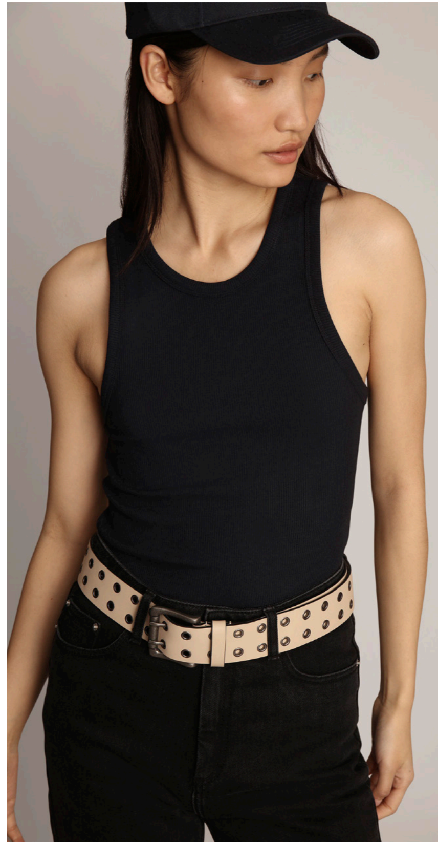
TOP / PEACH - JEANS / CULINARI - HAT / JEWEL - BELT / CADEN