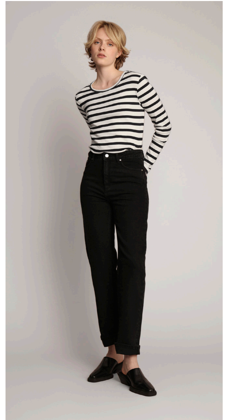
BLOUSE / JOTE - JEANS / CULINARI