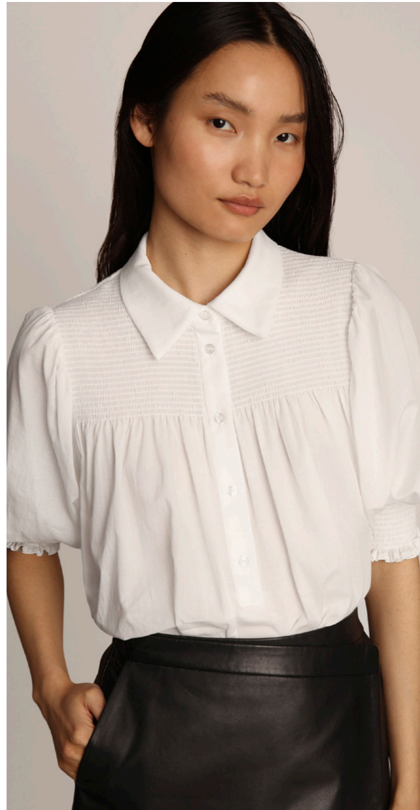
BLOUSE / CHAPTER - SKIRT / EXPANDRA