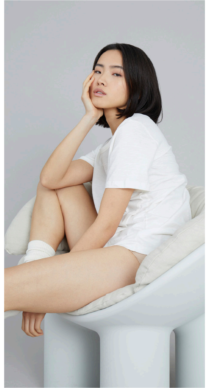
T-SHIRT / JULIANCO