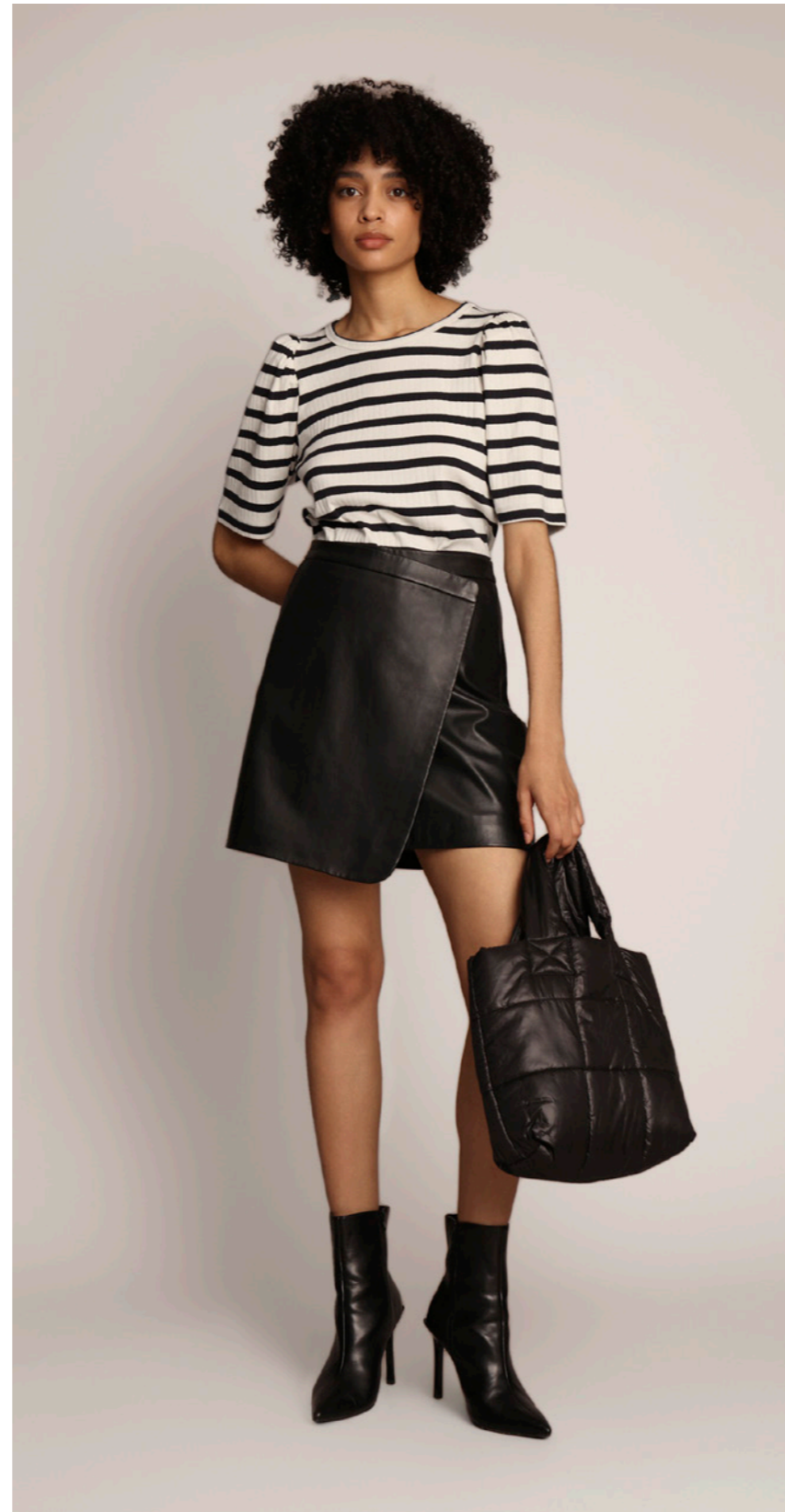
BLOUSE / JIKOLAZ - SKIRT / EXPANDRA - BAG / MILLA