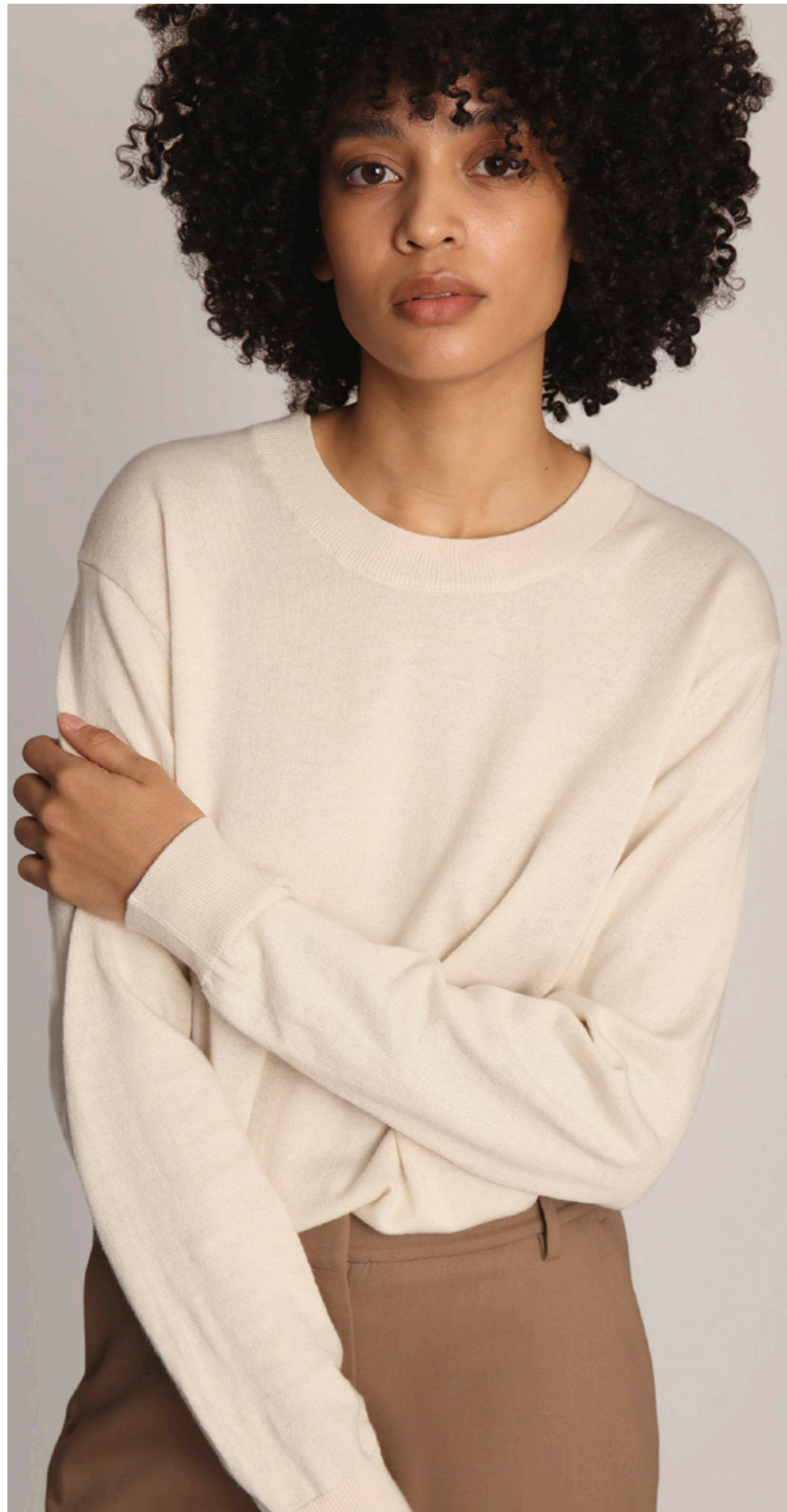
KNIT / SWELINA - PANTS / SUMATRA