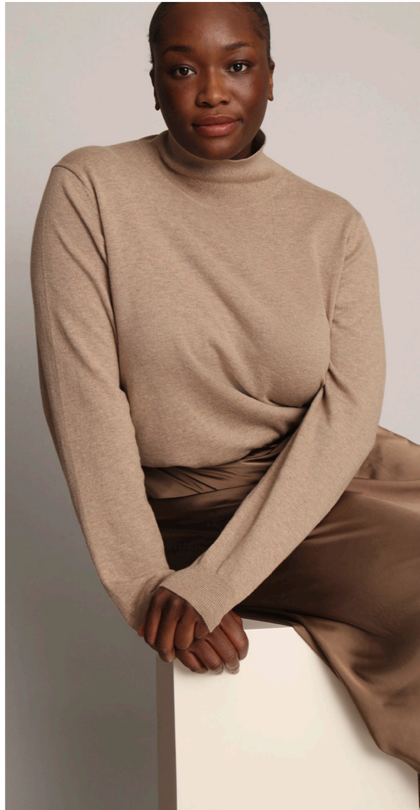
KNIT / GOLDBLOCK - SKIRT / BABE