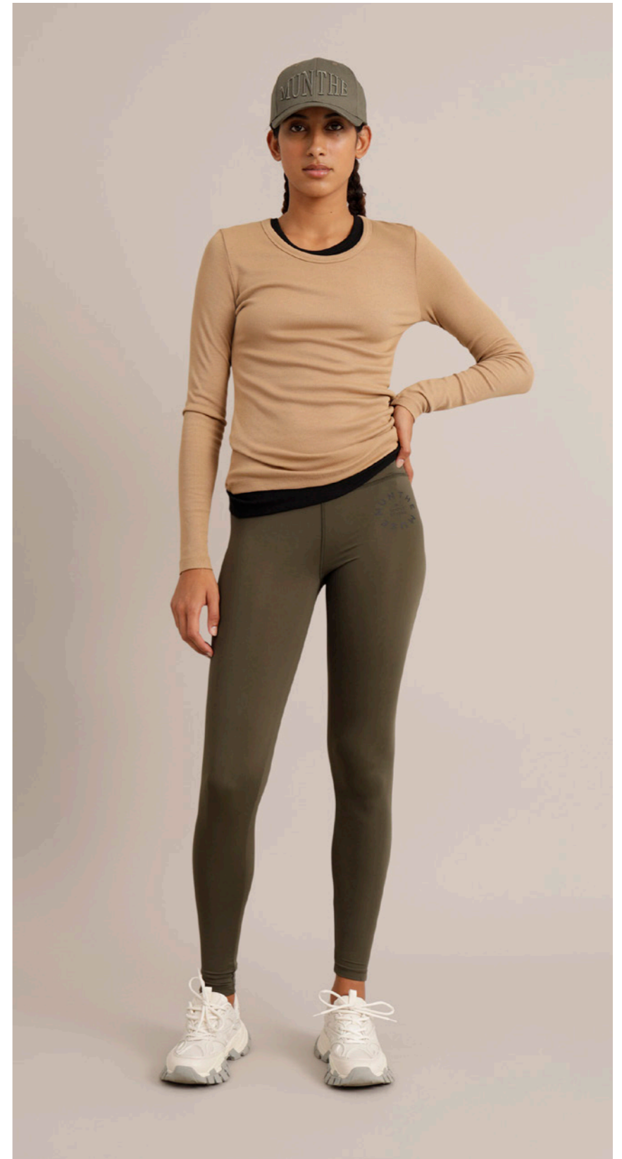
TOP / PEACH - BLOUSE / CUTEST - PANTS / SANDY - HAT / JEWEL