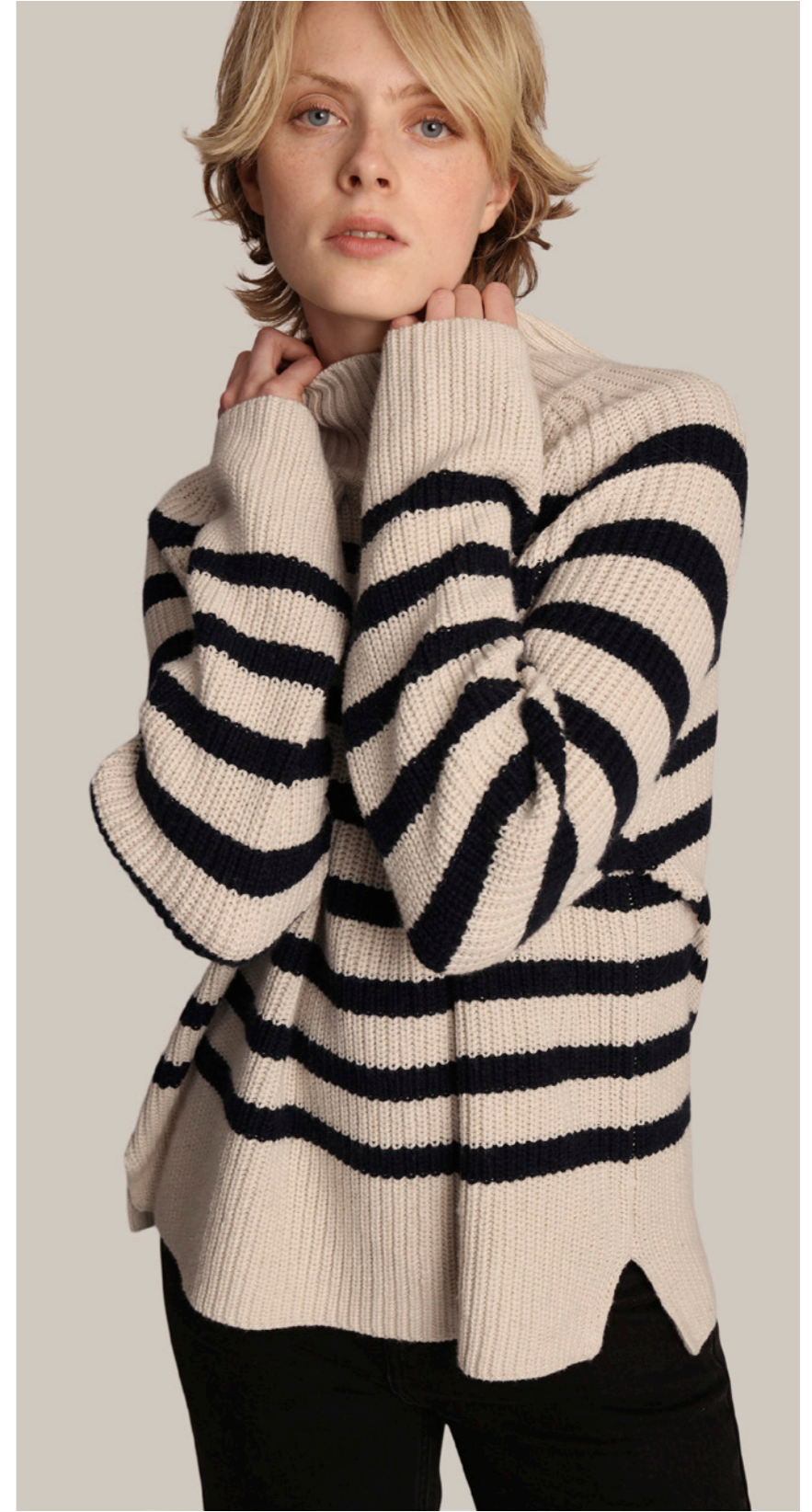
KNIT / ARISSA - PANTS / HOLLY