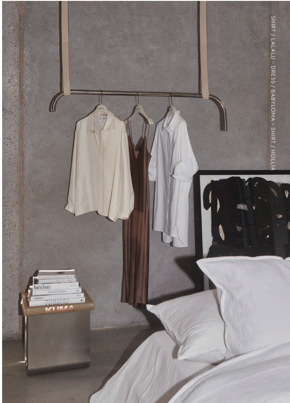
SHIRT / LALALU - DRESS / BABYLONIA - SHIRT / HOLLIA