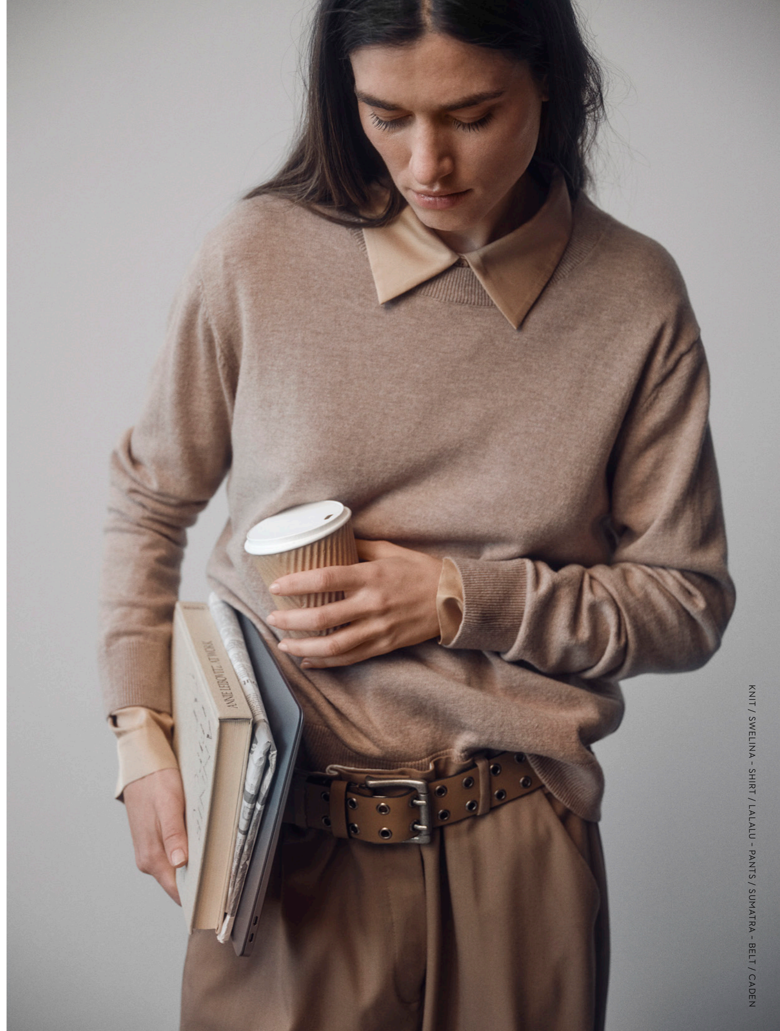
KNIT / SWELINA - SHIRT / LALALU - PANTS / SUMATRA - BELT / CADEN