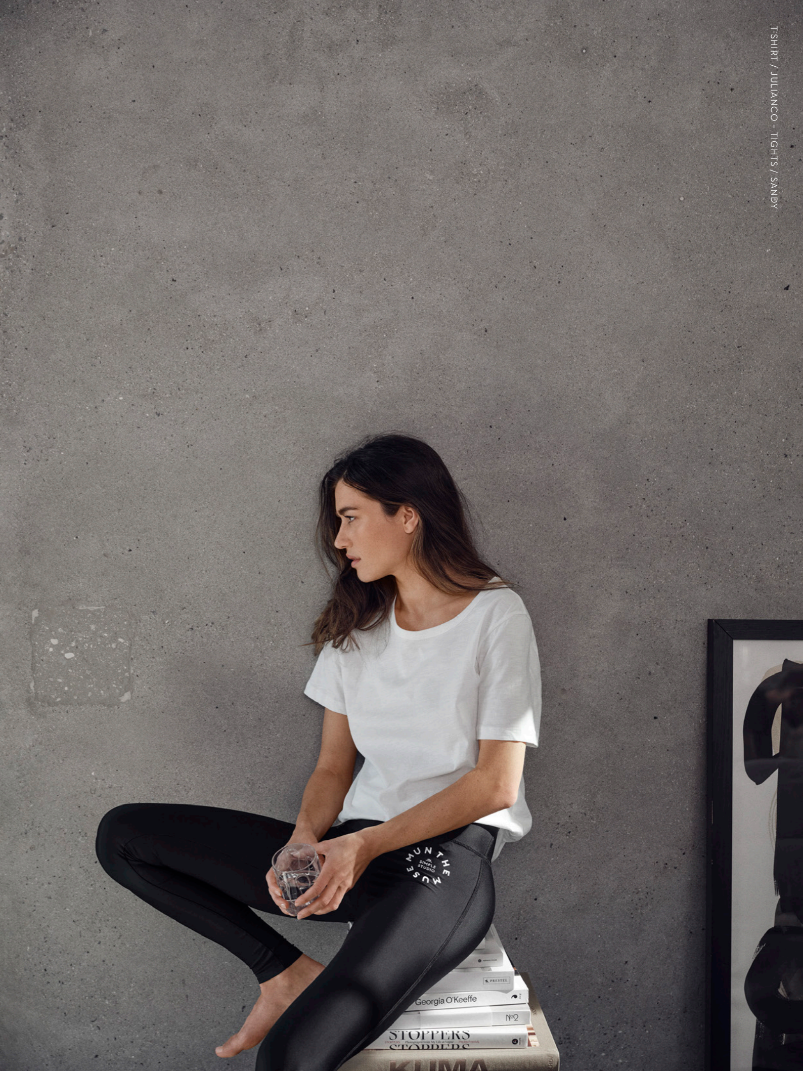
T-SHIRT / JULIANCO - TIGHTS / SANDY