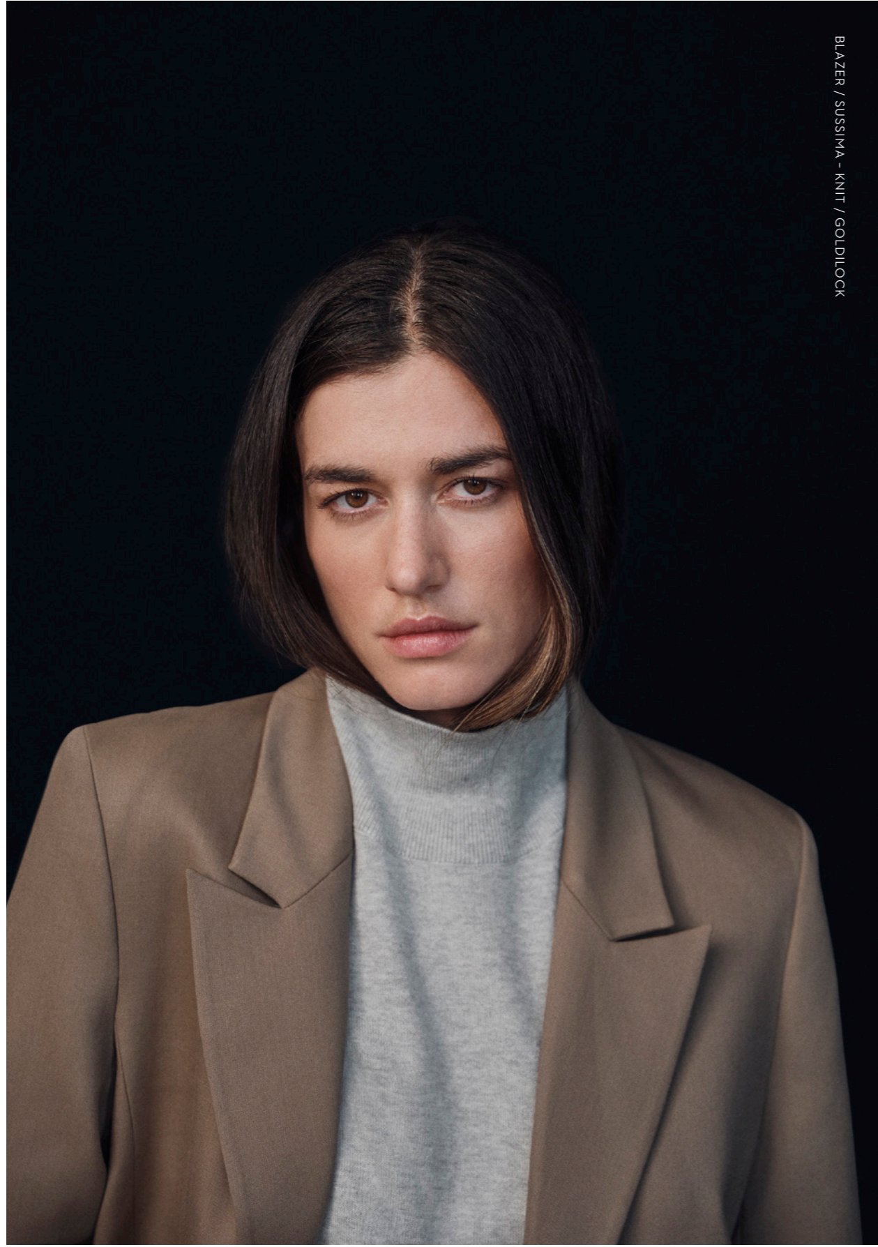
BLAZER / SUSSIMA - KNIT / GOLDLOCK