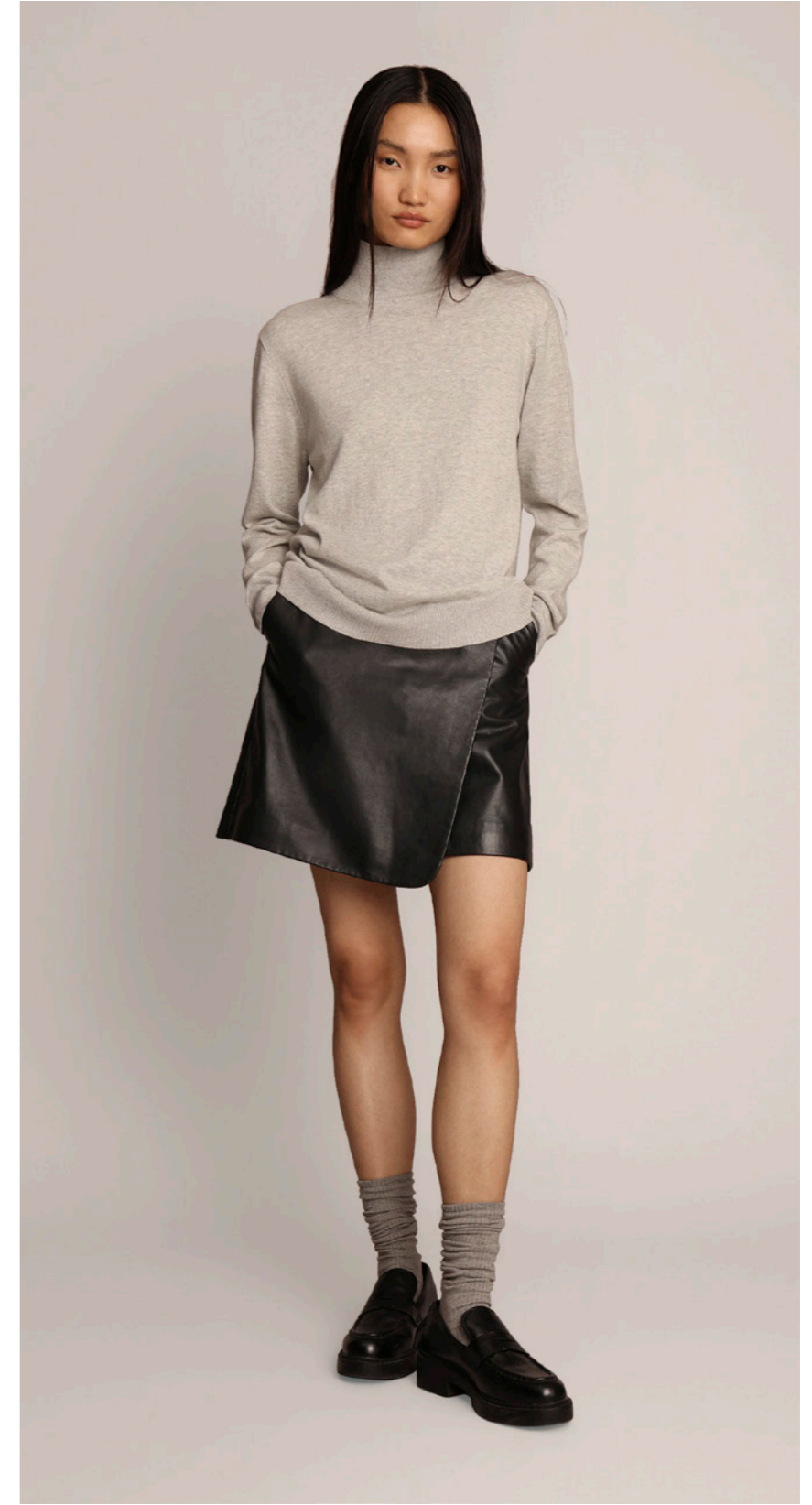
KNIT / GOLDBLOCK - SKIRT / EXPANDRA - SOCKS / GAKAN