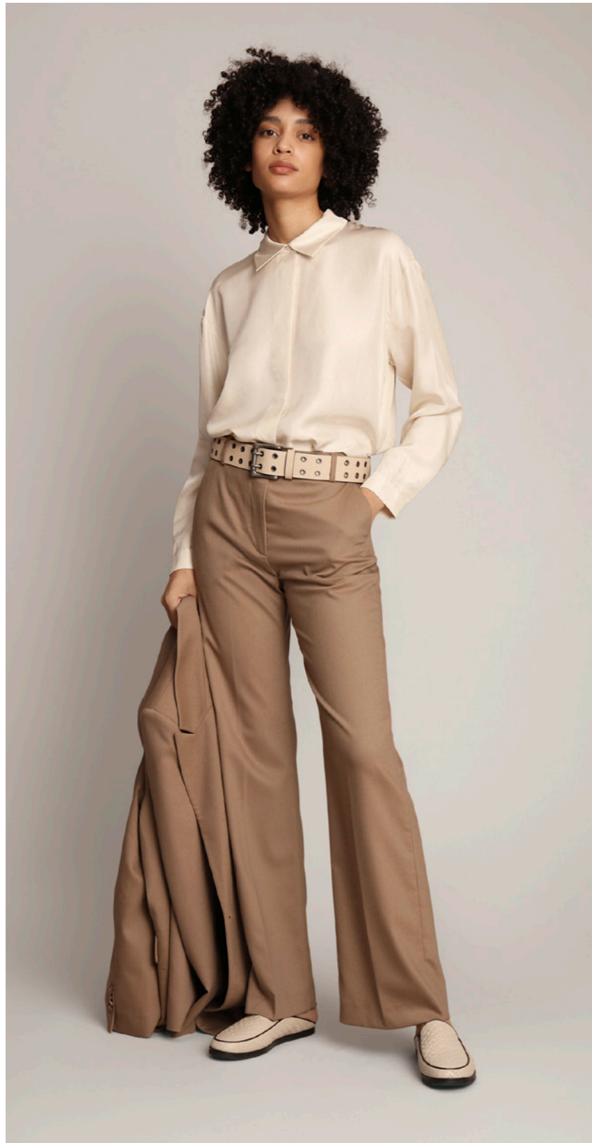
BLOUSE / LALALU - PANTS / SUMATRA - BLAZER / SUSSIMA BELT / CADEN