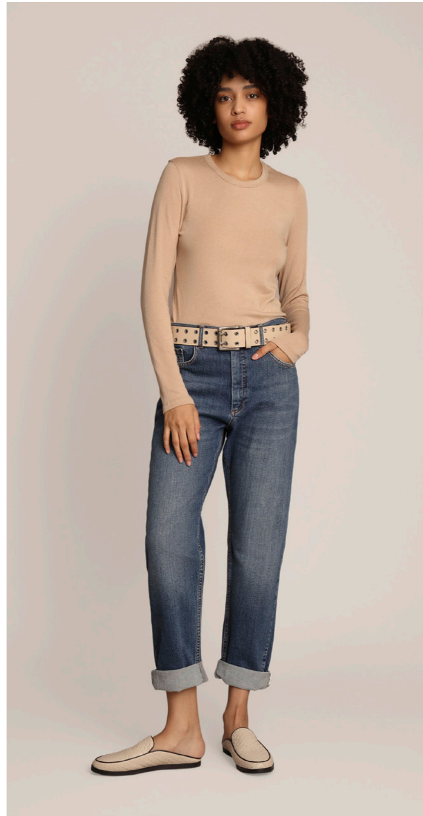
BLOUSE / LUTEST - JEANS / NAIOMIA - BELT / CADEN