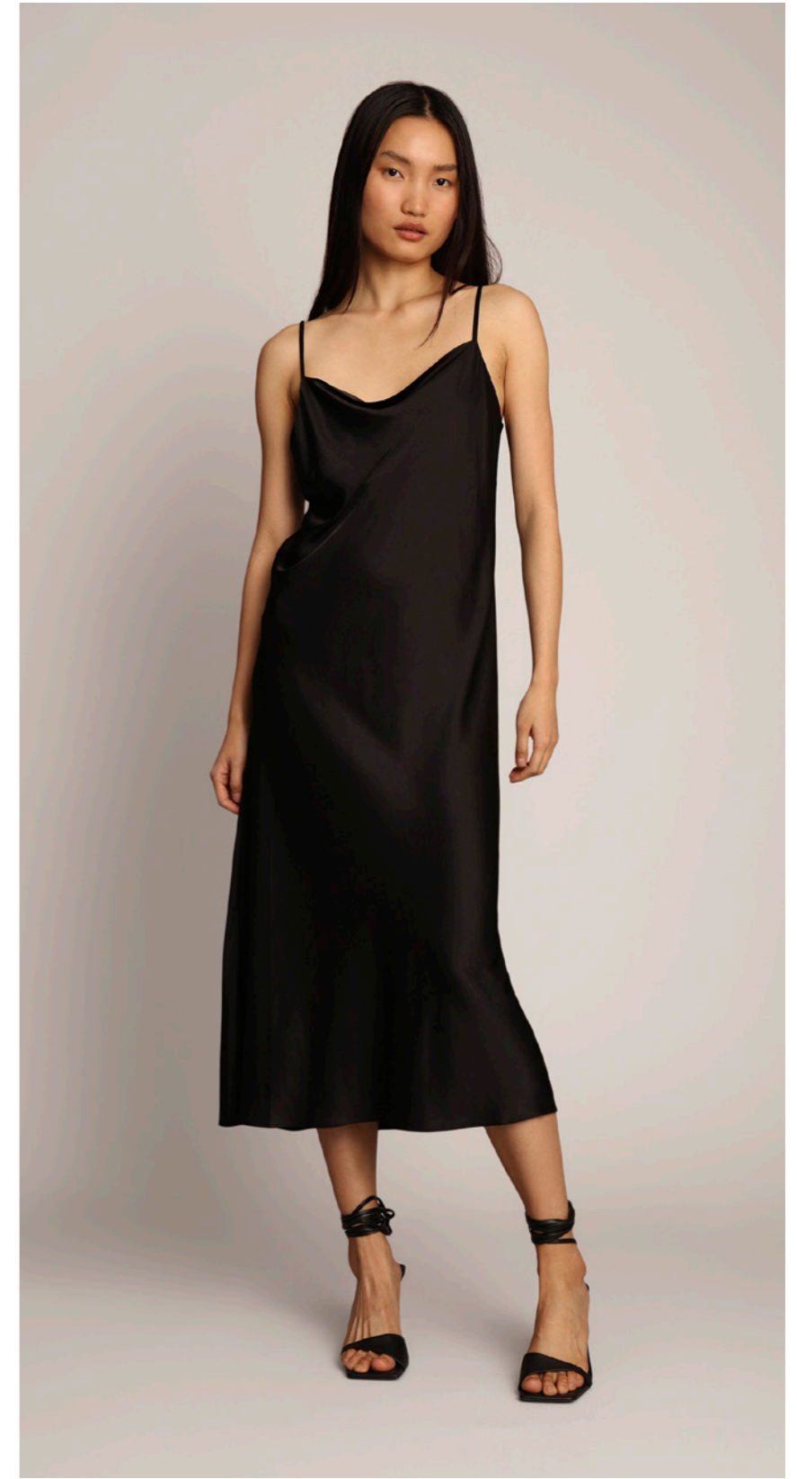
DRESS / BABYLOMA