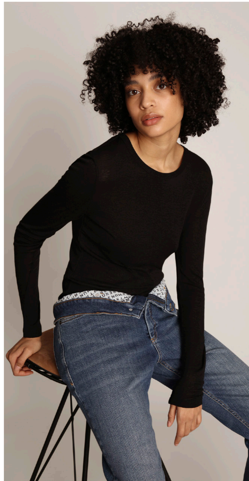
BLOUSE / CUTEST - JEANS / NAIOMIA