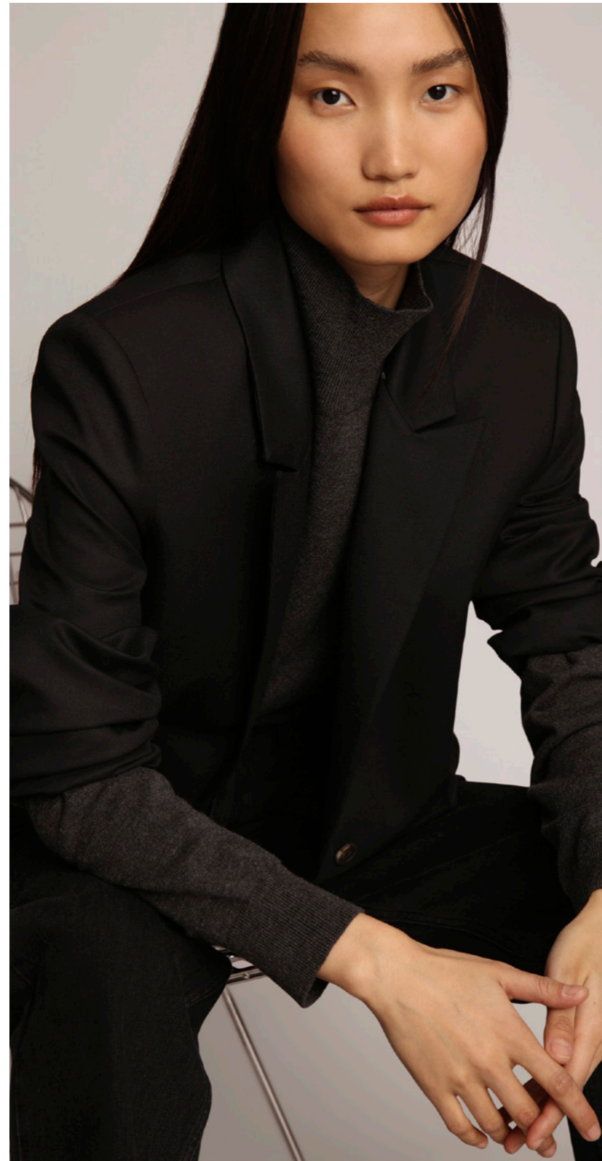
BLAZER / SUSSIMA - KNIT / GOLDILOCK - PANTS / SUMATRA