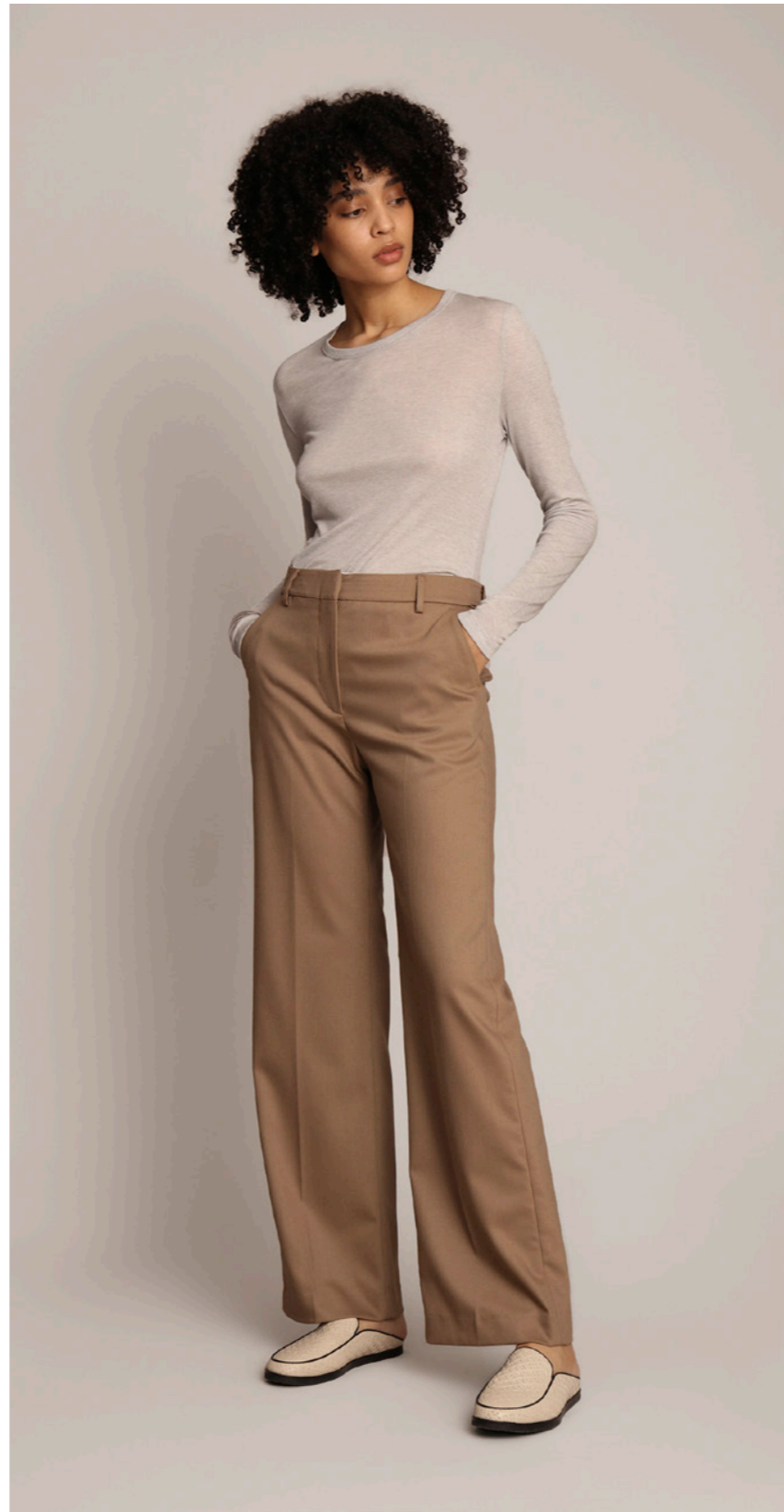
BLOUSE / LUTEST - PANTS / SUMATRA