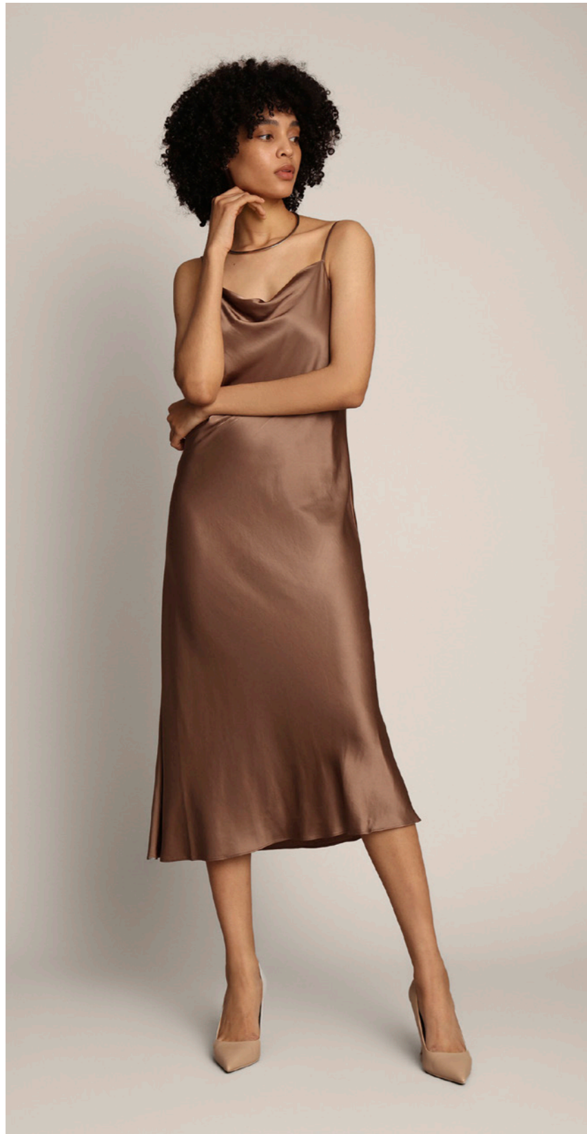
DRESS / BABYLOMA