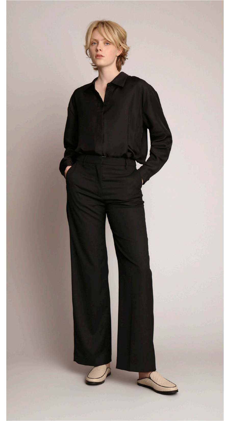
BLOUSE / LALALU - PANTS / SUMATRA